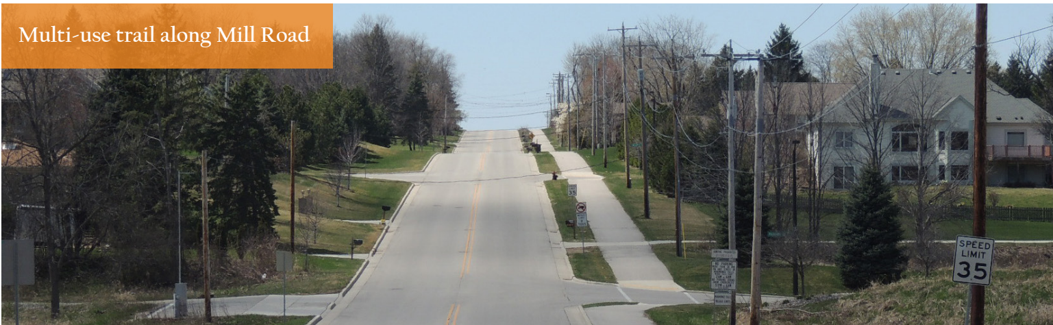
Multi-use trail along Mill Road