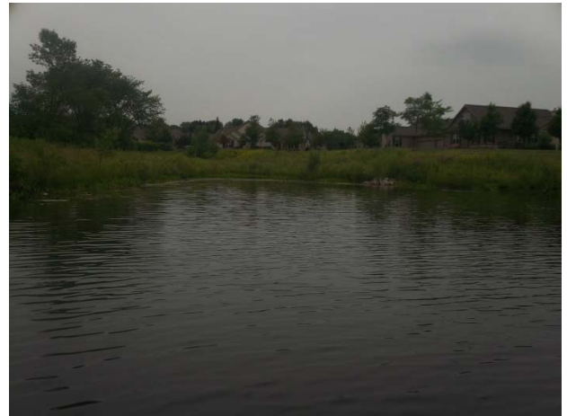
Figure 5: Photo from Center of Pond Looking West