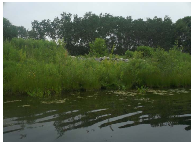
Figure 6: Photo of Emergency Spillway Located on the Southeast Portion of the Pond, West of the Outlet Structure