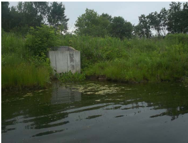
Figure 3: Photo of Outlet Structure Located on the Southeast Portion of the Pond