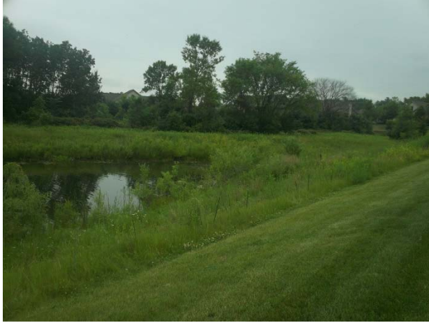
Figure 1: Overview of the West Portion of the Pond Looking Southwest