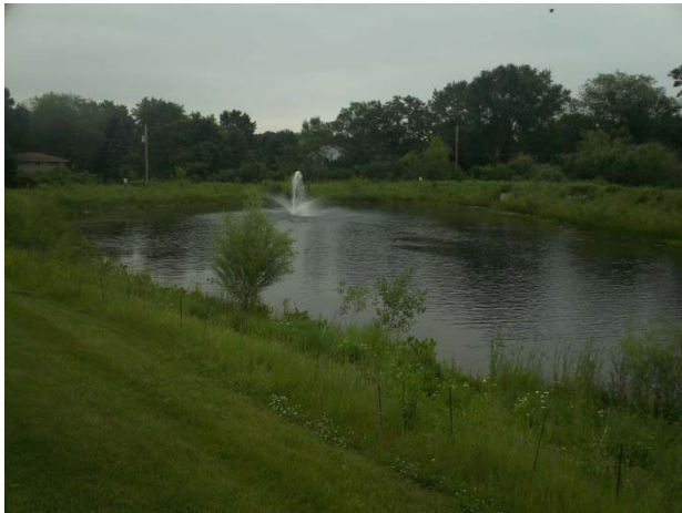
Figure 2: Overview of the East Portion of the Pond Looking East