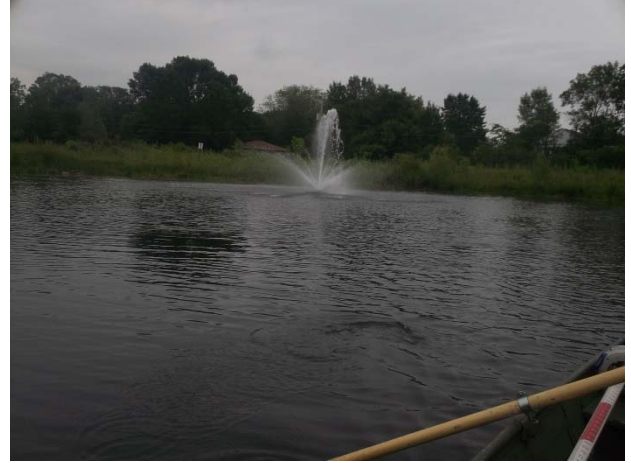
Figure 4: Photo from Center of Pond Looking East