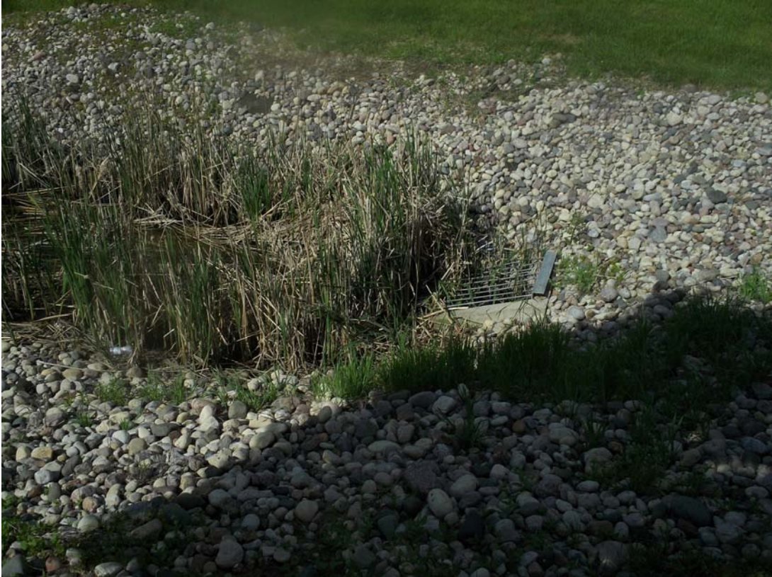
Figure 5: At northwest portion of pond; looking southwesterly (pond outlet structure)