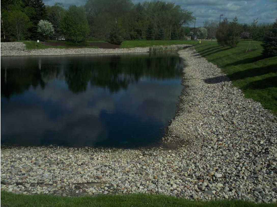
Figure 1: At northeast portion of pond; looking northwesterly (emergency spillway and pond outlet structure)