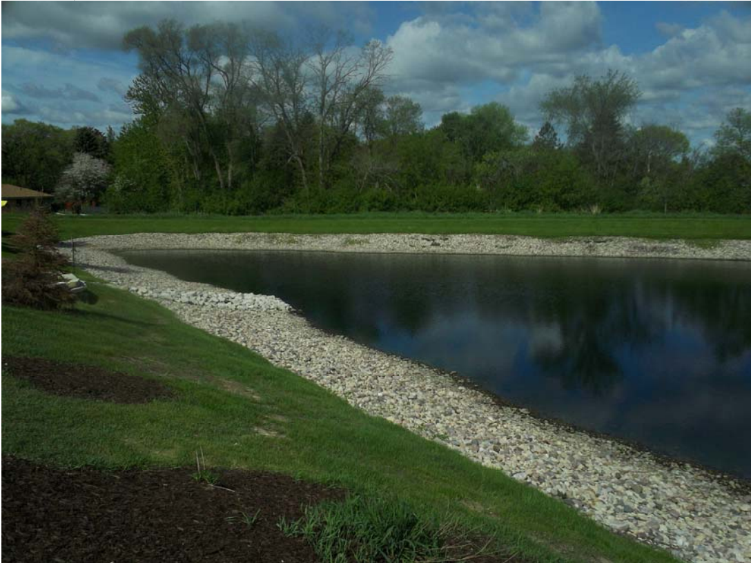
Figure 2: At northeast portion of pond; looking southeasterly (storm outfall)