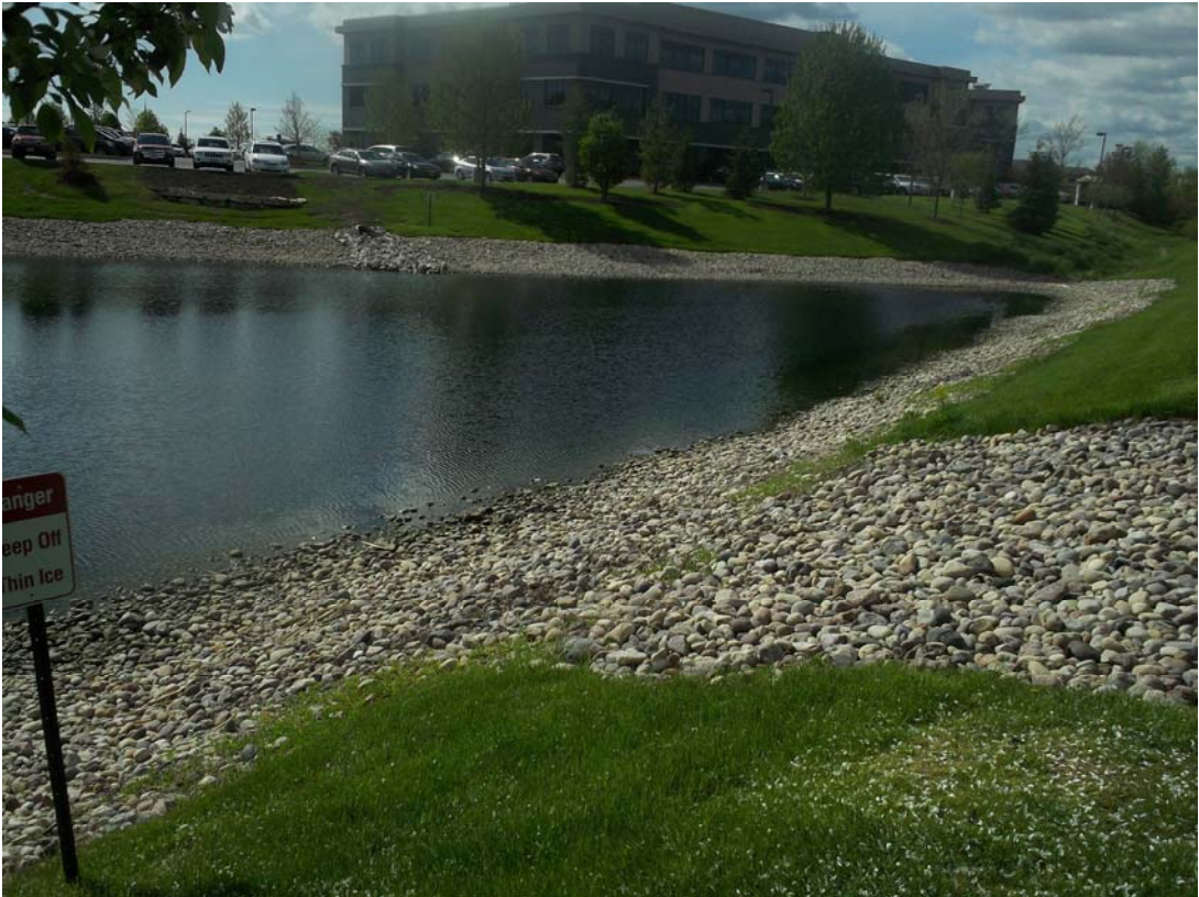
Figure 6: At northwest portion of pond; looking southeasterly (storm outfall and emergency spillway)