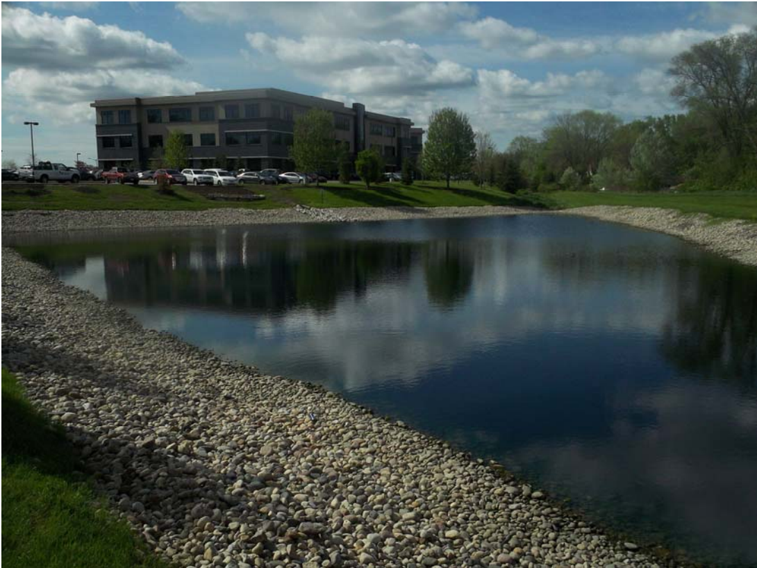
Figure 4: At northwest portion of pond; looking southeasterly (storm outfall)