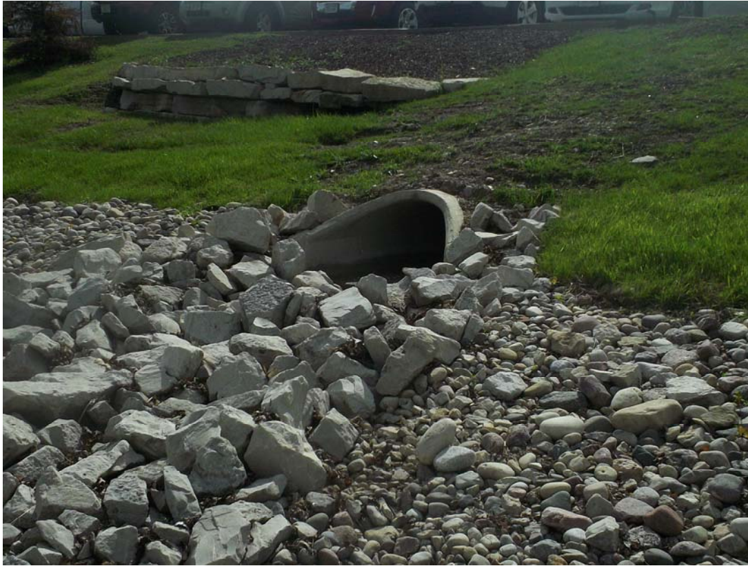
Figure 7: At east portion of pond; looking easterly (storm outfall)