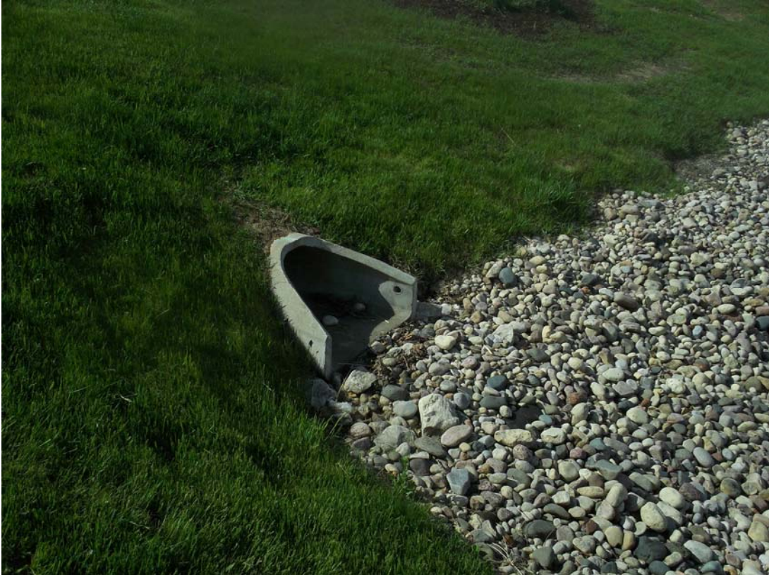
Figure 3 At northeast portion of pond; looking easterly (storm outfall)