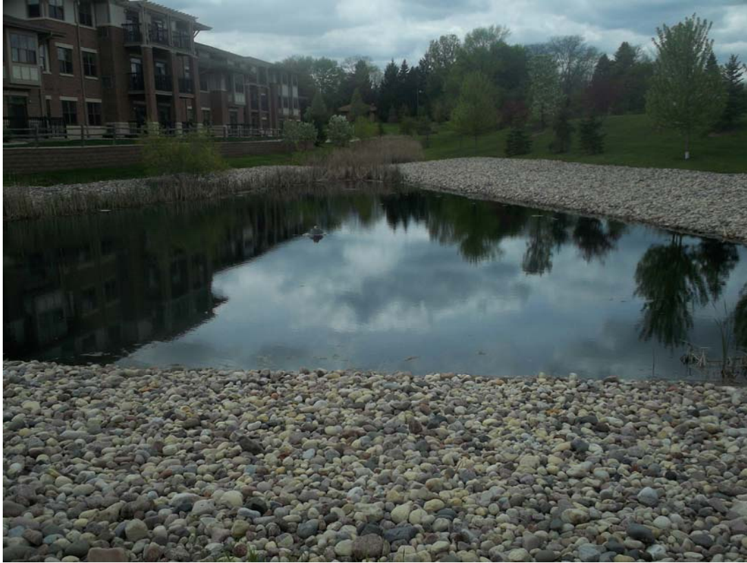
Figure 1: At east portion of pond; looking westerly (storm outfall)