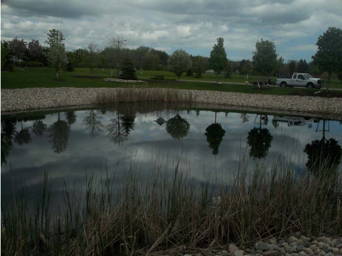
Figure 3: At southwest portion of pond; looking northeasterly