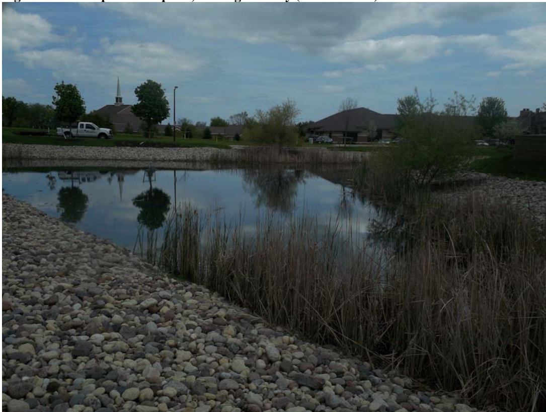
Figure 2: At west portion of pond; looking easterly (pond outlet structure)