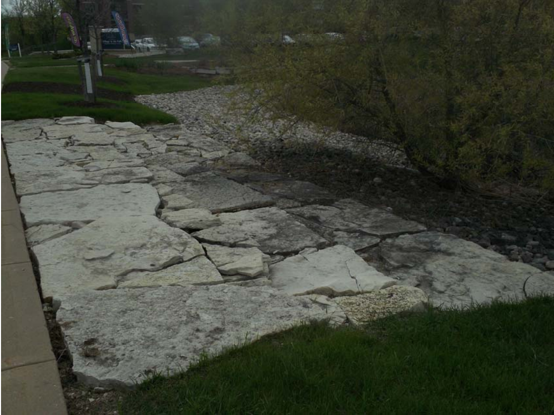
Figure 6: At east portion of pond; looking southerly (emergency spillway)