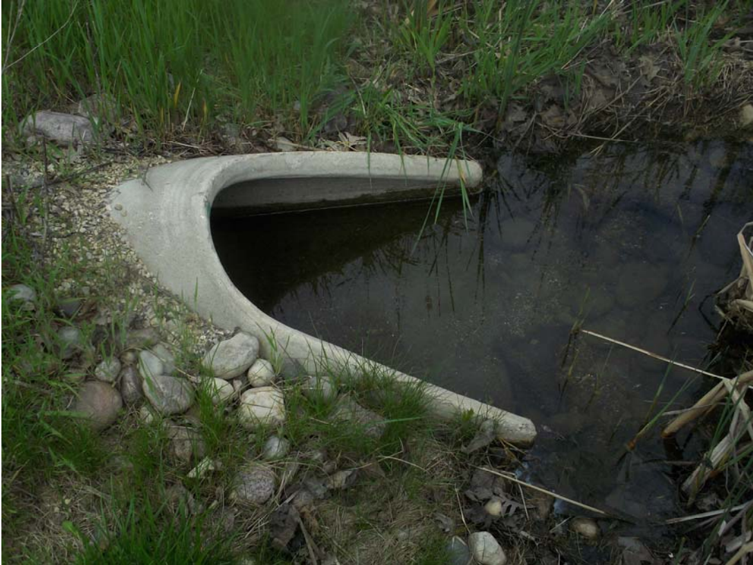
Figure 4: At west portion of pond; looking northerly (storm outlet)