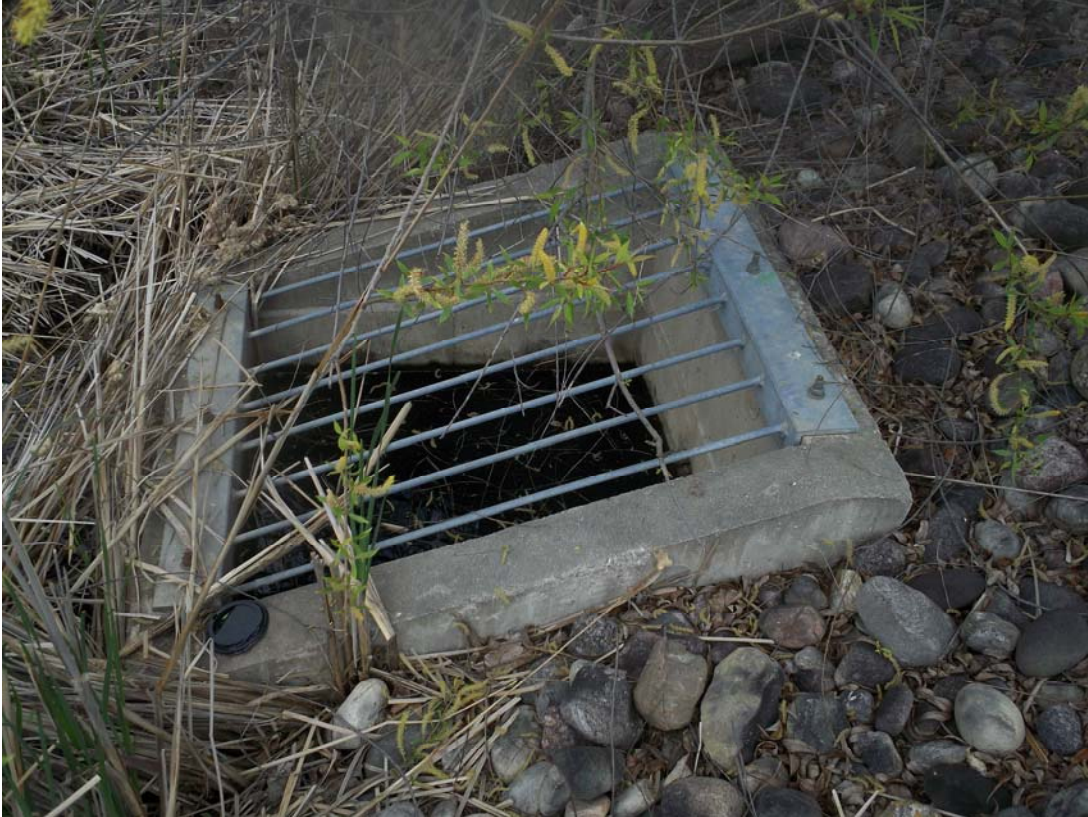
Figure 5: At east portion of pond; looking northerly (pond outlet structure)