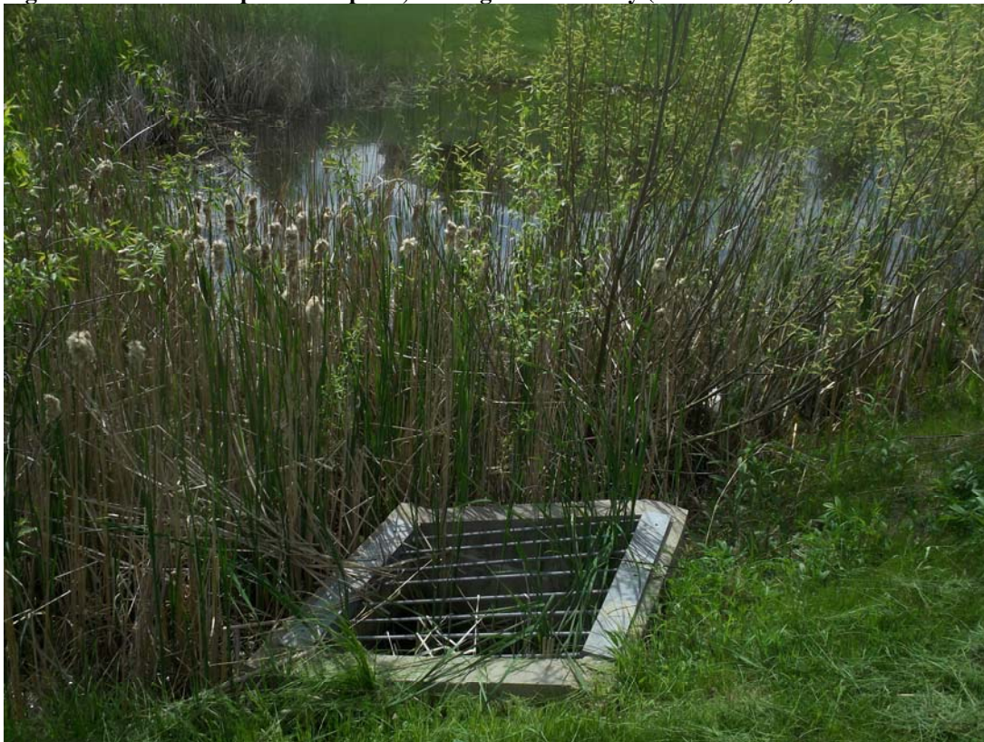
Figure 2: At northeast portion of pond; looking southerly (pond outlet structure)