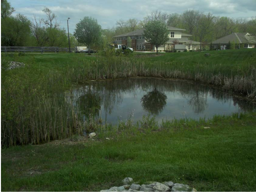
Figure 1: At northeast portion of pond; looking southwesterly (storm outfall)