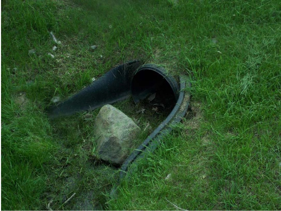
Figure 3: Approximately 40 north of pond; looking southerly (pond outfall)