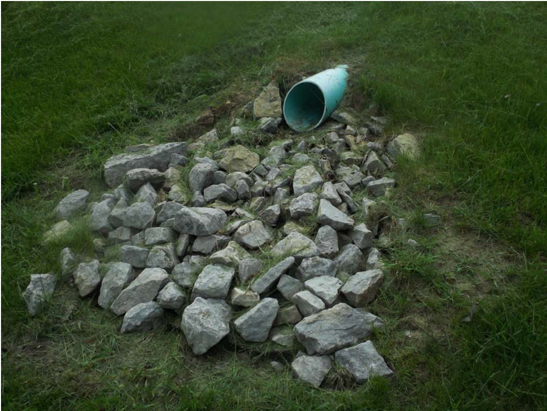
Figure 5: At southwest portion of pond; looking southerly (storm outfall)