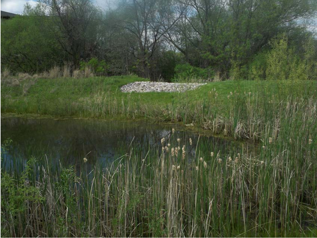
Figure 6: At south portion of pond; looking northerly (emergency spillway)