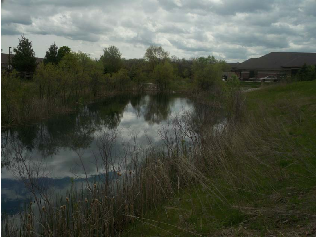
Figure 1: At north portion of pond; looking southerly (storm outfall and pond outlet)