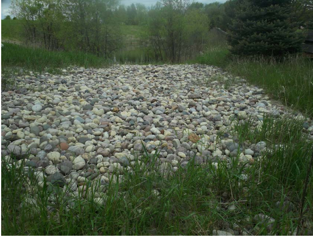
Figure 5: At south portion of pond; looking northerly, pond in background (emergency spillway)