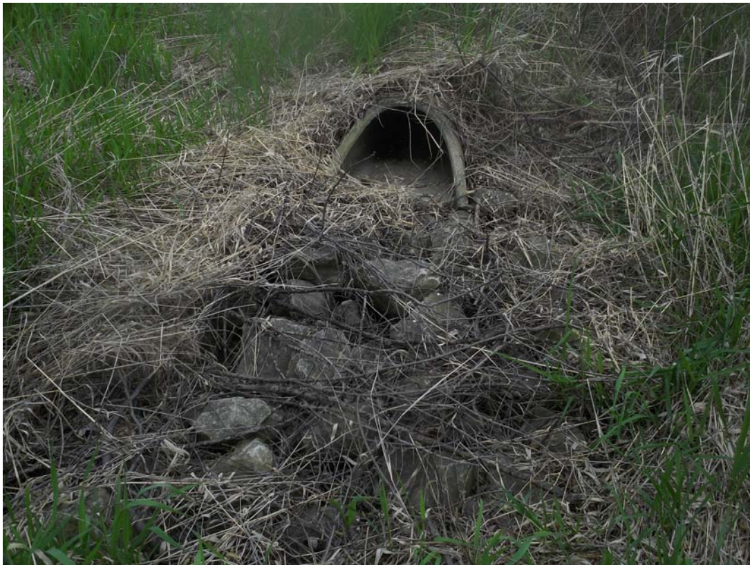
Figure 6: Approximately 80 feet south of pond; looking northerly (pond overflow outlet)