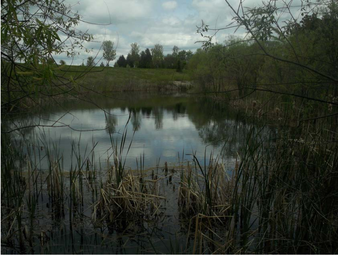
Figure 7: At south portion of pond; looking northerly (rip rap)