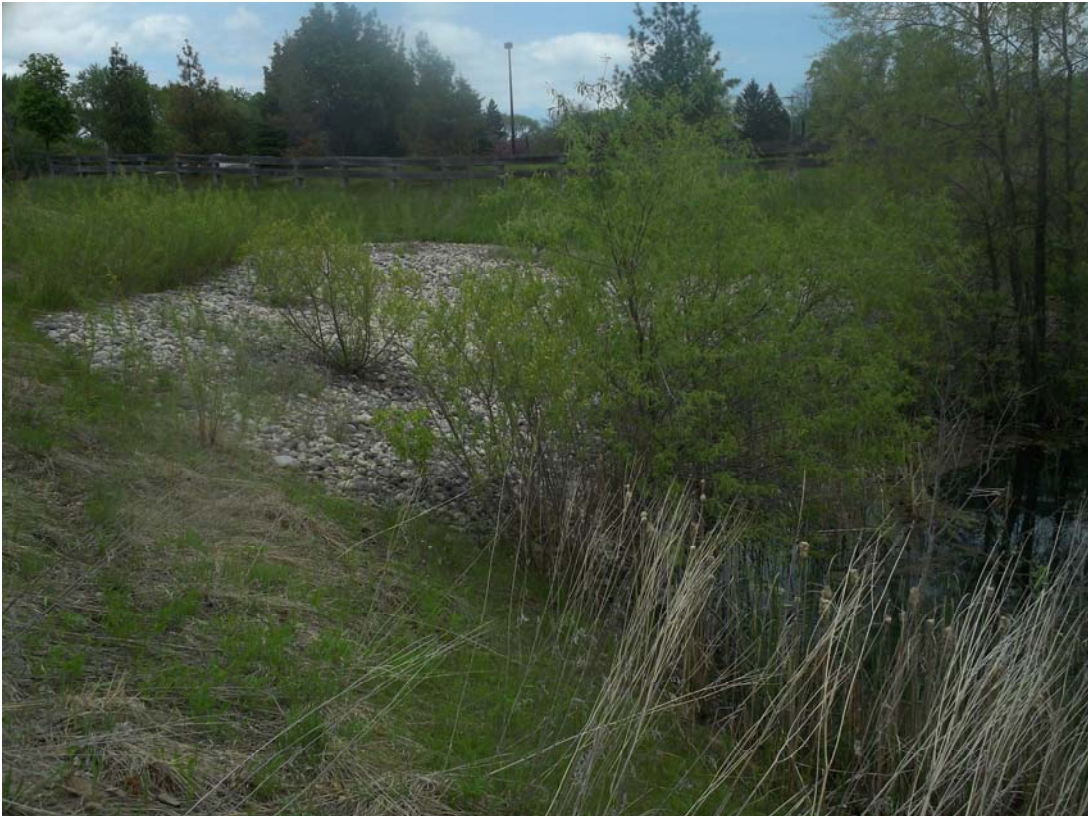
Figure 2: At north portion of pond; looking northerly (rip rap)