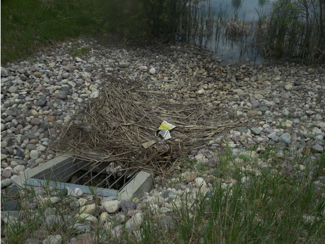
Figure 4: At south portion of pond; looking northerly (pond outlet structure)