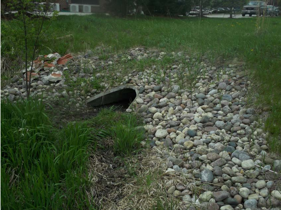
Figure 3: At south portion of pond; looking westerly (storm outfall)