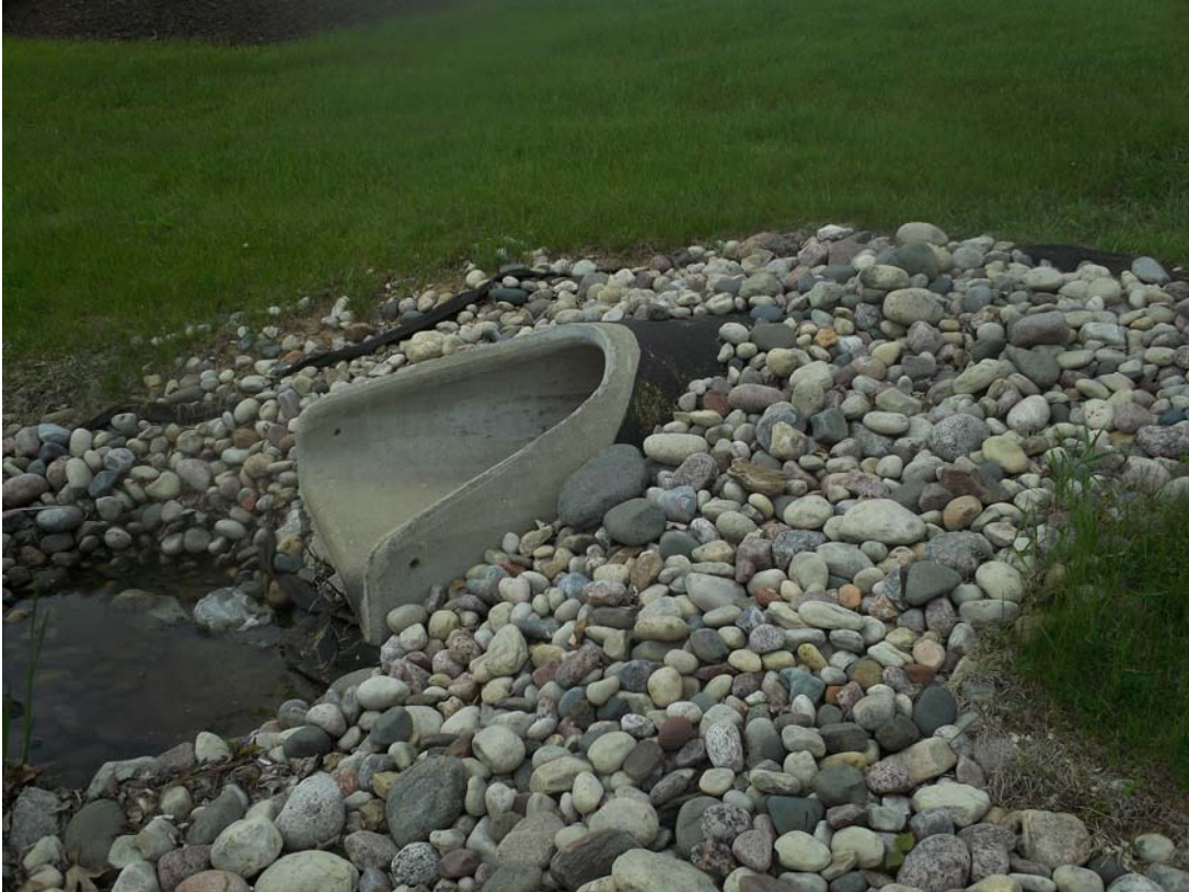
Figure 3: At southwest of pond; looking southeasterly to storm outfall into pond