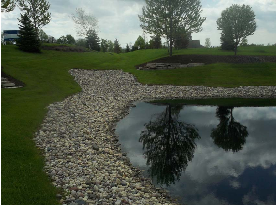
Figure 6: At northeast portion of pond; looking easterly (emergence spillway)