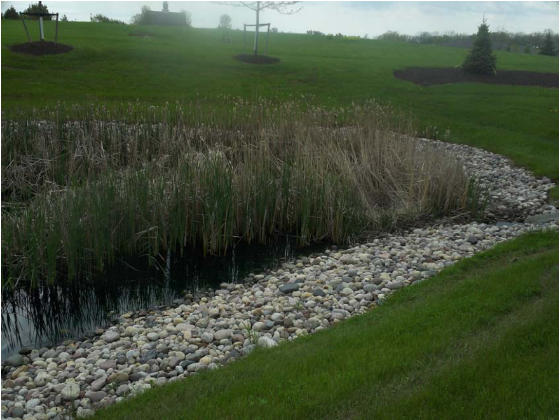
Figure 2: At southwest portion of pond; looking southwesterly (storm outfall)