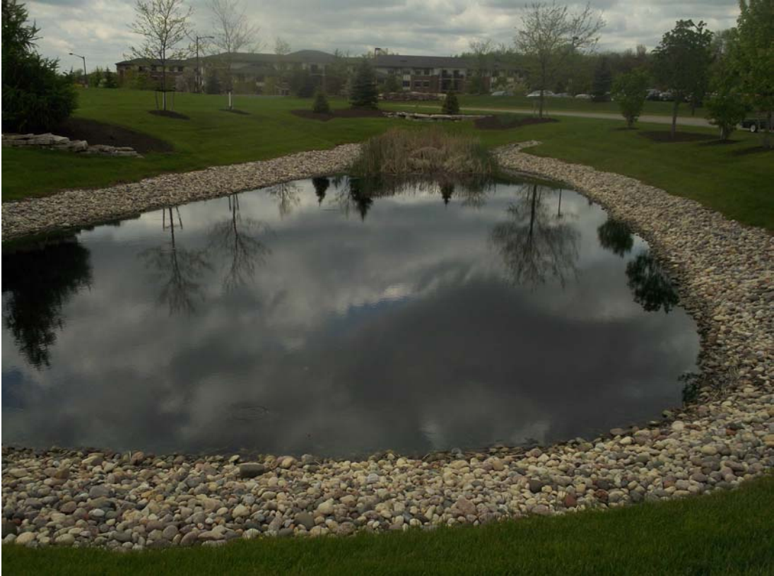
Figure 1: At north portion of pond; looking southerly to storm outfall