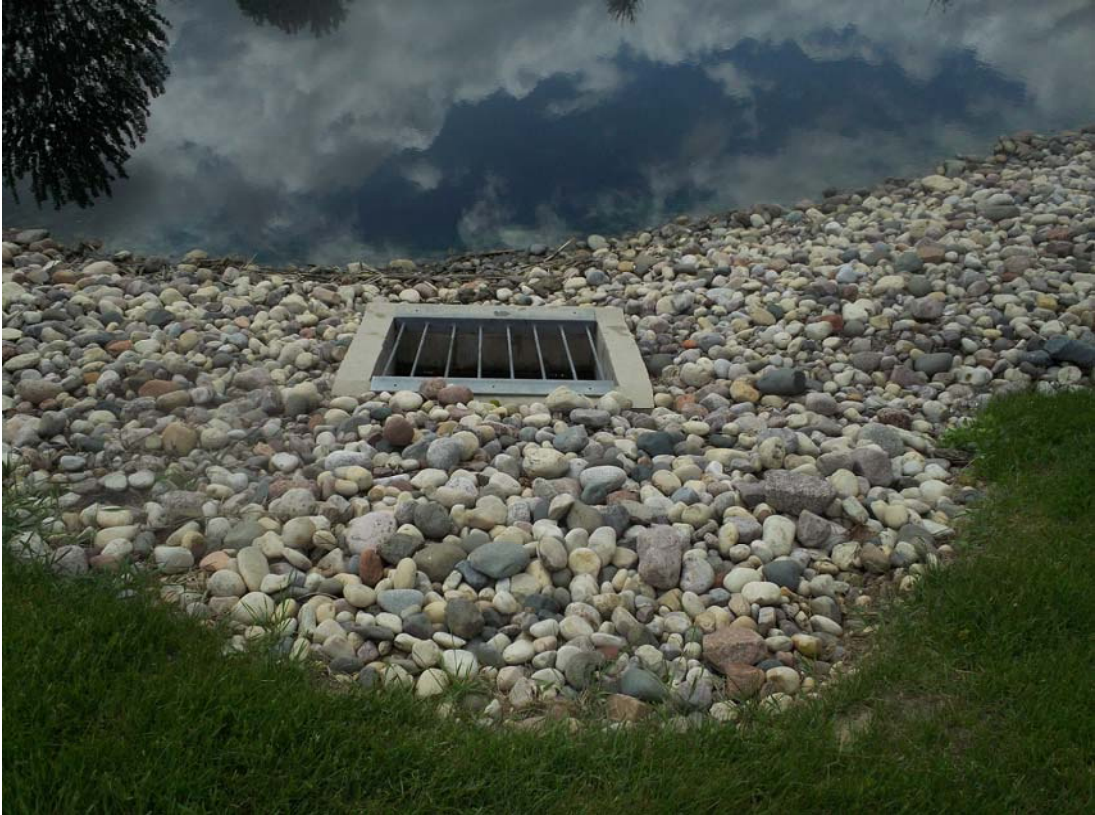
Figure 5: At northeast portion of pond; looking easterly (pond outlet structure)