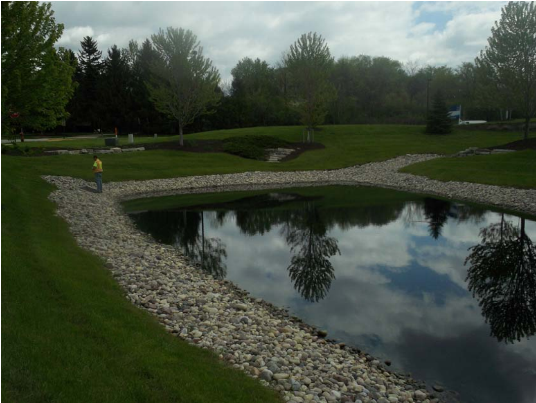
Figure 4: At southwest portion of pond; looking northeasterly (pond outlet and emergency spillway)