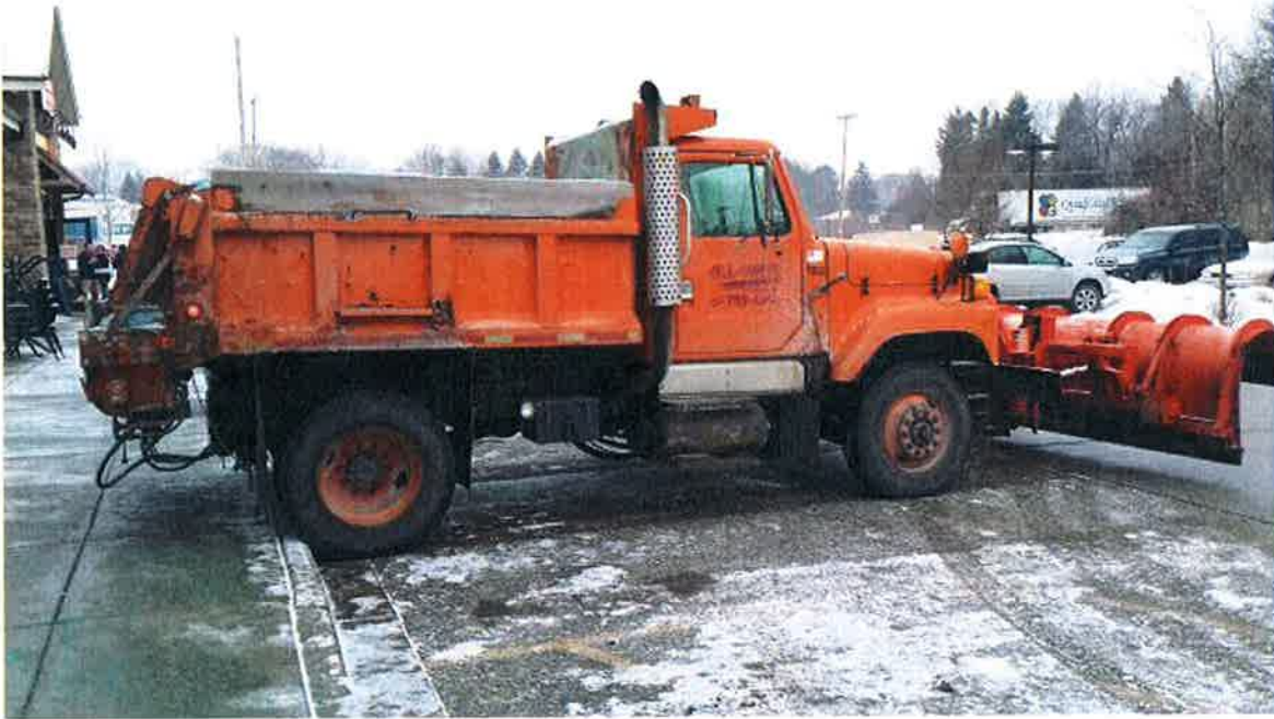
Photo #2: Porous pavement in north parking field of west building. No visible signs of wear from snow removal operations.

Photo #1: Snow removal equipment with salt only and plastic plow blade.