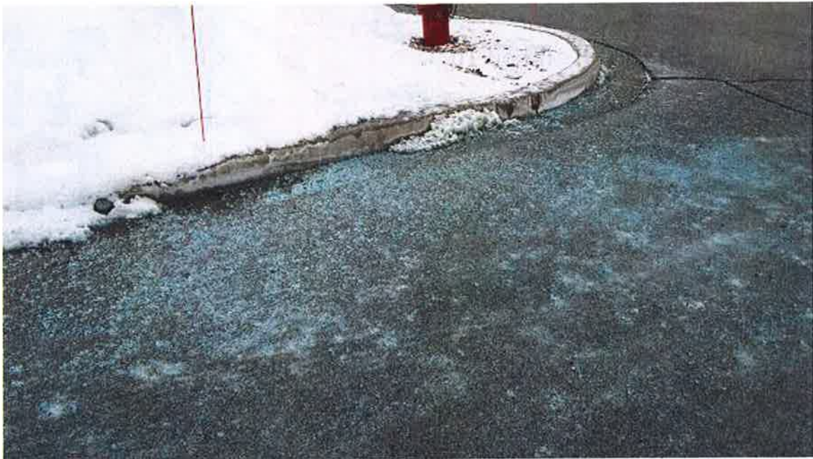
Photo #4: Results of snow removal and salting operations following a +1" snow event.