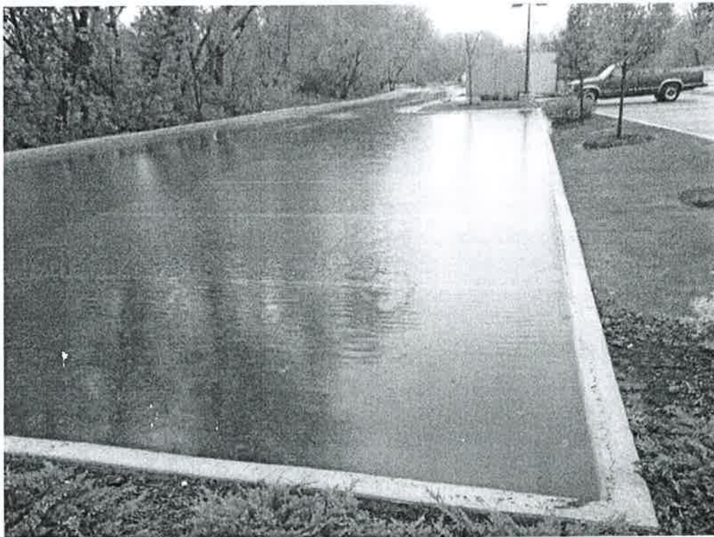
Taken standing on northeast porous pavement parking area looking east.