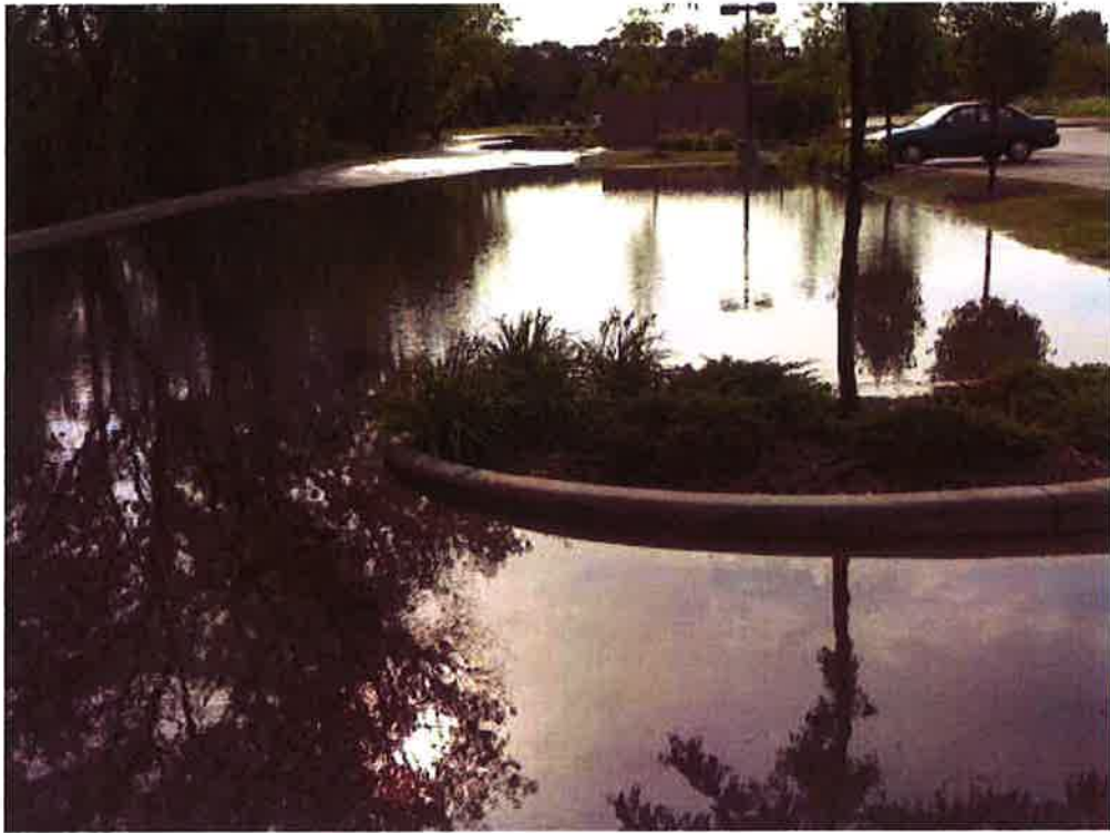
Standing on the northwest corner of the parking lot looking east toward outfall structure. Ponding is limited to the northeast porous pavement parking area.