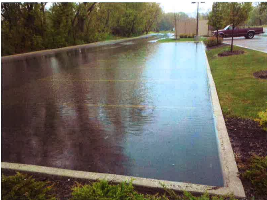
Taken standing on northeast porous pavement parking area looking east.