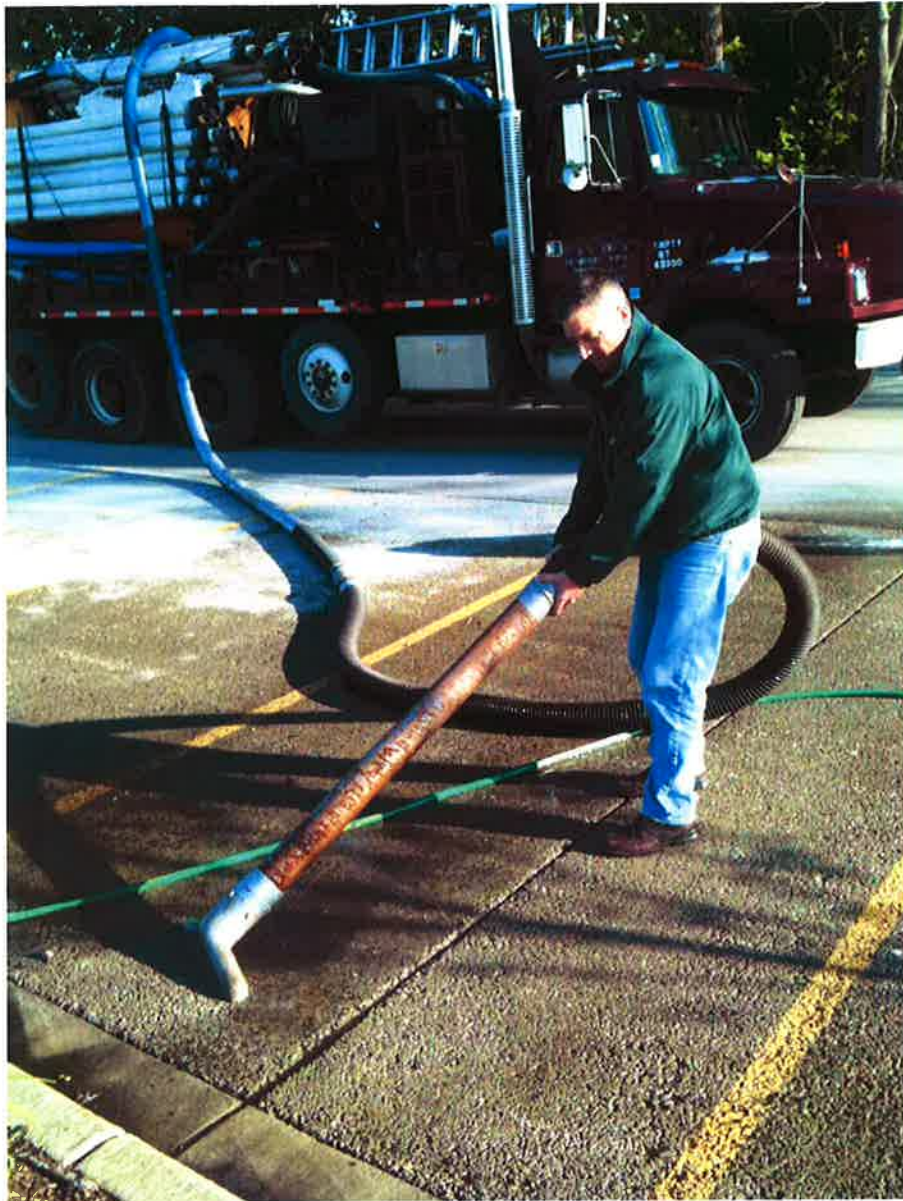
Cleaning included flushing the debris to the surface with a garden hose and removing the water and debris from the surface with an industrial vacuum truck.