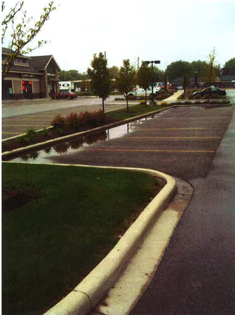
Taken standing from northeast corner of north porous pavement parking area looking west prior to cleaning.