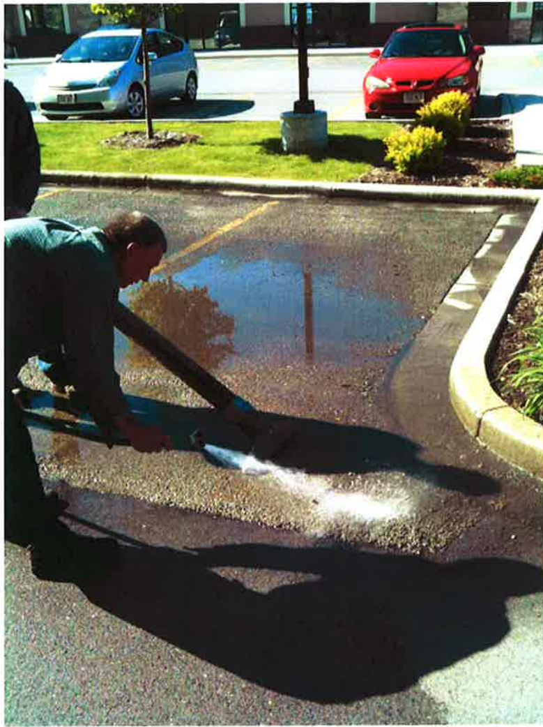
Photo of cleaning effort to remove surface debris and improve the drain down times for the northeast porous pavement parking area.