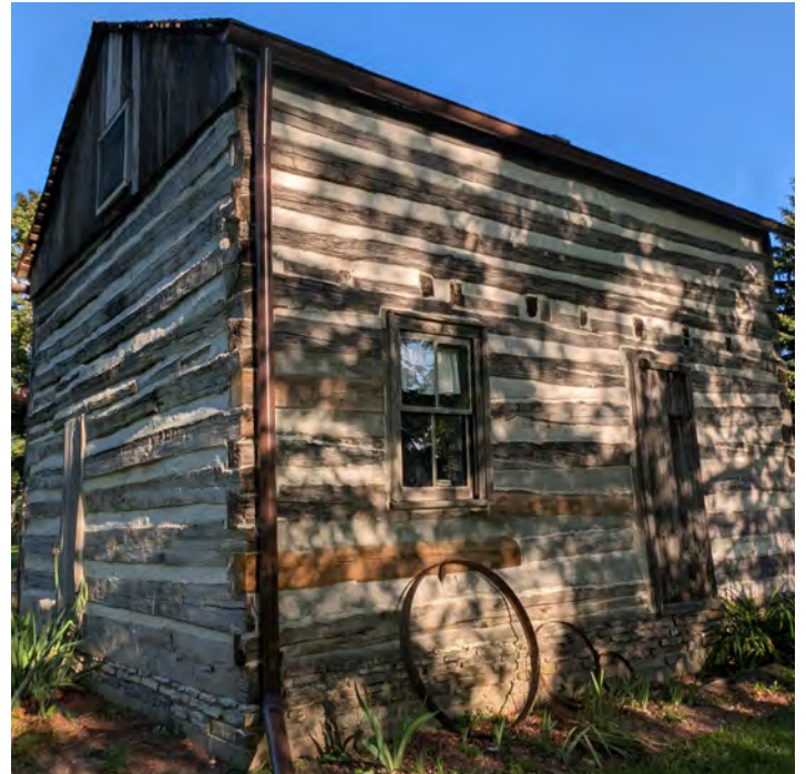
Umhoefer Log Cabin

The Steichen House had fallen into significant disrepair and required extensive work this year. Over winter, volunteers worked to rehab all the storm windows that had been removed many years ago and stored in the basement of the house. The work involved scraping, sanding, glazing, and glass replacement. Now most of the windows have a storm window for additional protection. The next area addressed was the south east corner of the addition on the building. This section was not set onto the foundation and began to drift away from the main house. Efforts were made to jack and reposition that corner and then place a cinder block foundation for support. These efforts were successful and that corner is now supported. Our volunteers and a nudge from a front-end loader from the Village helped make it possible.