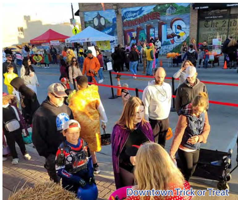
Downtown Trick or Treat

Keep up with all the fall events happening across the community at menomonee-falls.org/calendar