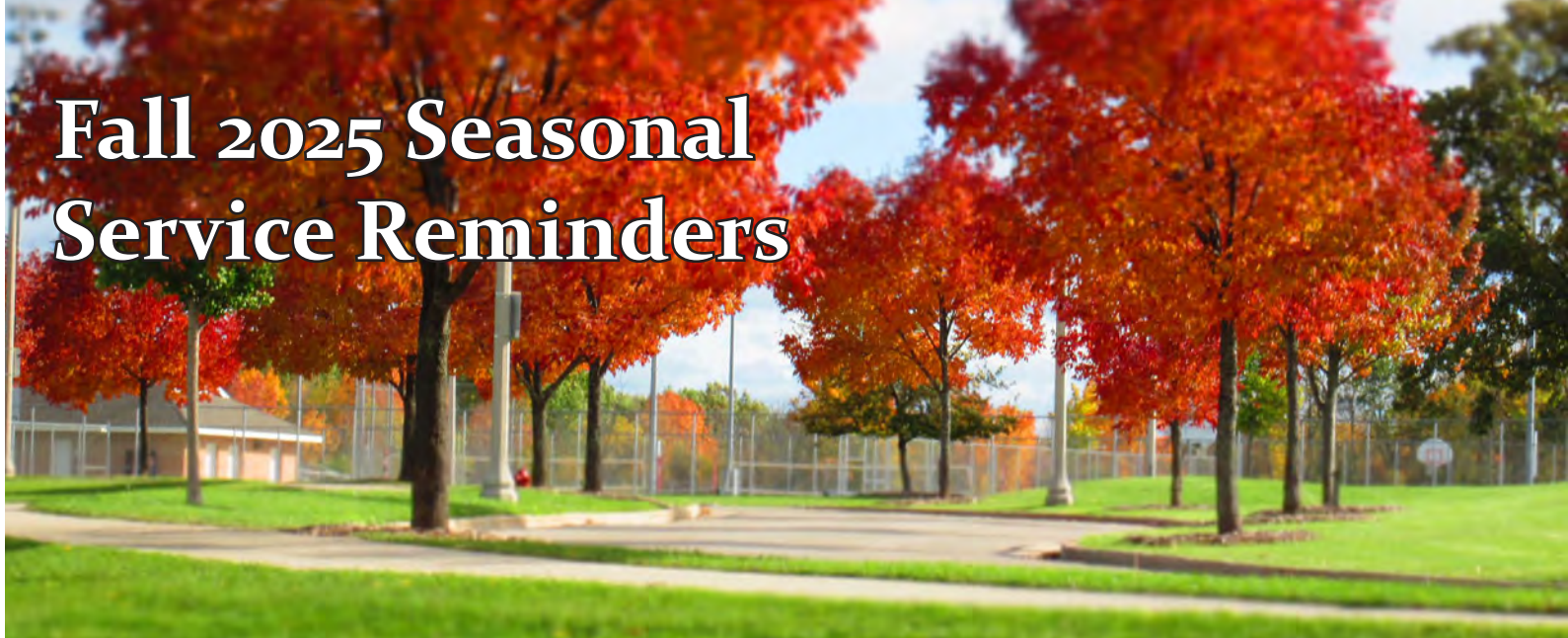
Above: Trees along Dennis Droese Drive at Oakwood Park