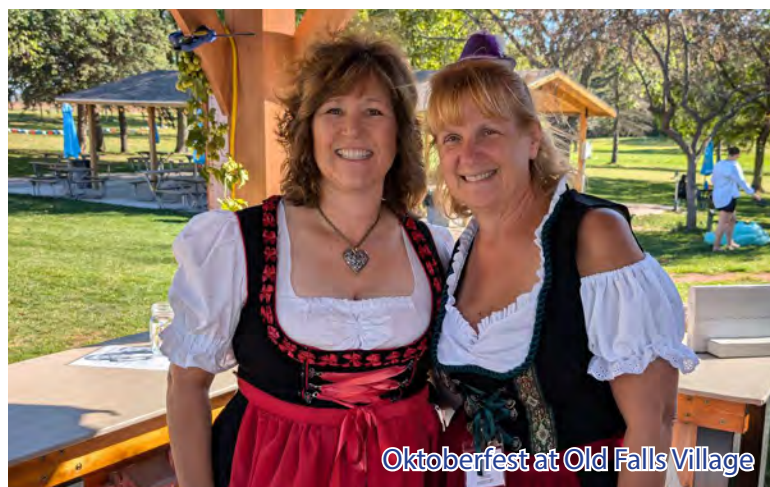
Oktoberfest at Old Falls Village