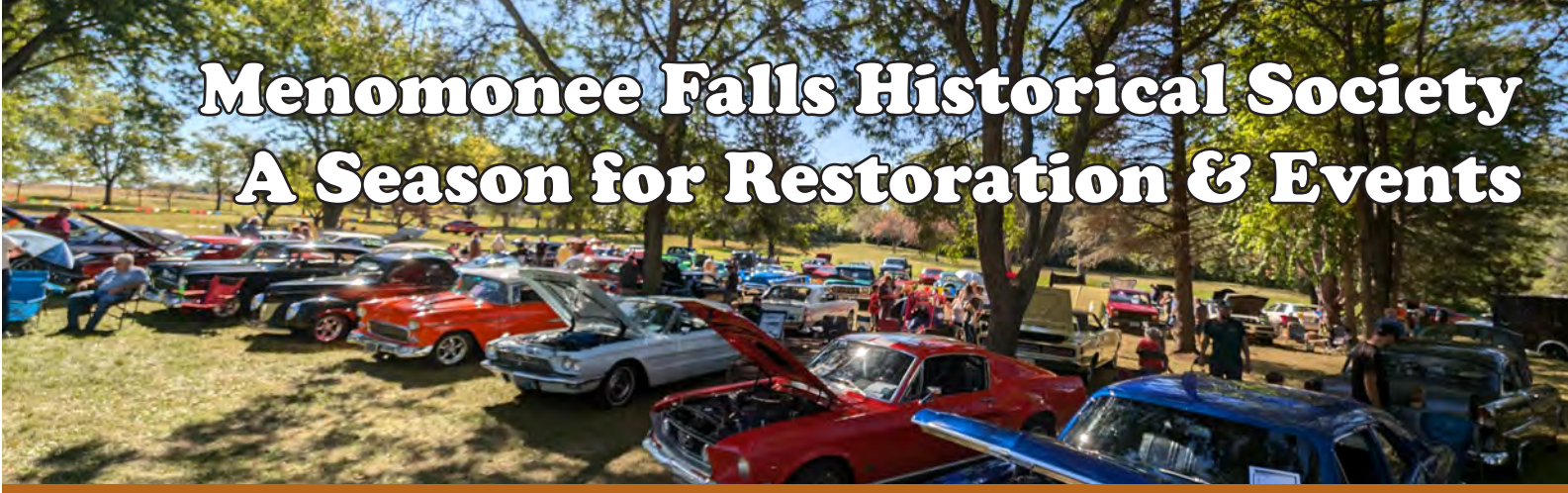
2024 Classic Car Show at Old Falls Village