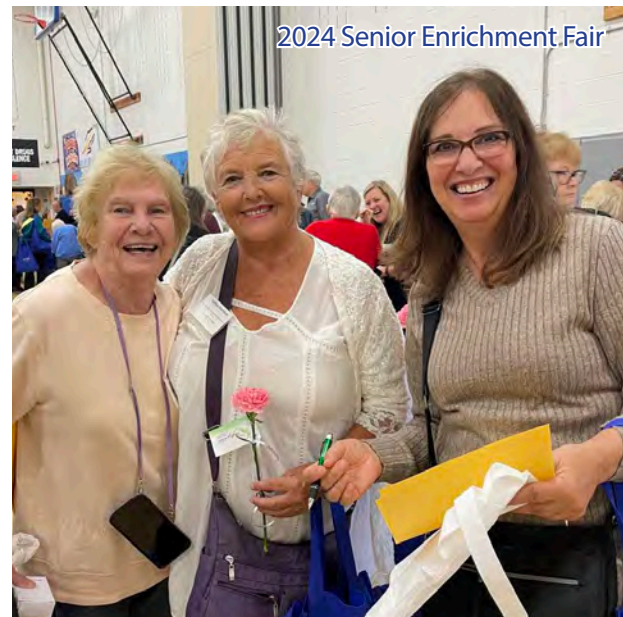
2024 Senior Enrichment Fair

Grab a friend and register for the 16 th Annual Senior Enrichment Fair on October 17 th ! Enjoy demonstrations, vendors, informational classes, lunch, door prizes and musical entertainment. The fee is only $10. Register today!