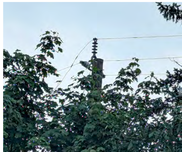
A downed wire following a recent storm event