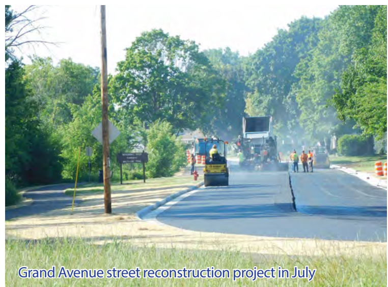
Grand Avenue street reconstruction project in July