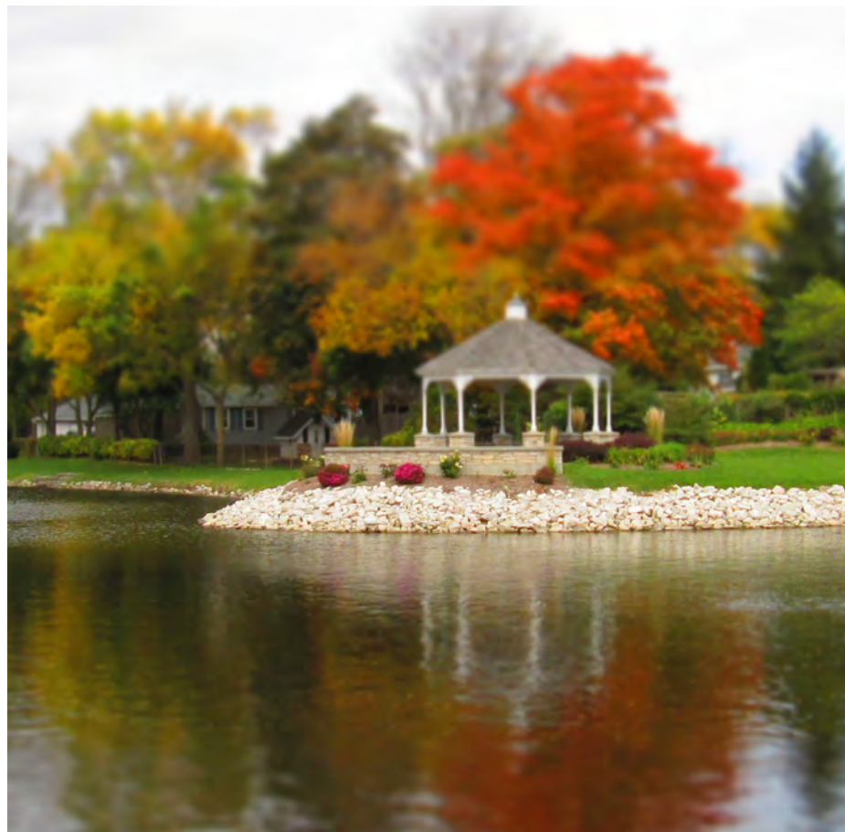
Autumn colors at Mill Pond Park

To learn more about the topics covered in The Current and for further information about all things Menomonee Falls, visit www.menomonee-falls.org or call us at 262-532-4200. Sign up for our Newsletter Notify Me to receive email links to all Village e-newsletters.