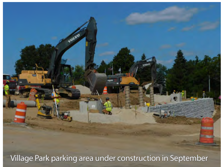
Village Park parking area under construction in September

For more information about public projects, visit menomonee-falls.org/publicprojects