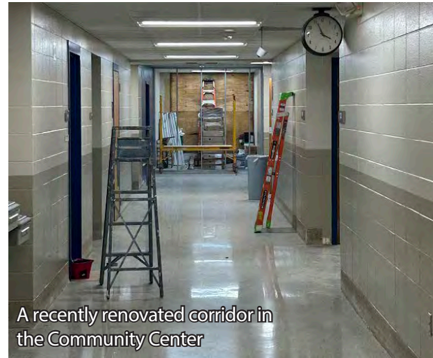
A recently renovated corridor in the Community Center

It has been a busy summer with the renovations taking place at the Community Center. While there is still a lot of work to be done with the new addition, the renovation of existing spaces was finished in early September. Work included polished concrete floors, painting, replacement of ceiling tiles, updated restrooms, flooring upgrades, some utility updates, elevator updates, and prep work to connect the current building with the new addition. Site work for the new portion of the building has taken place, the foundation has been poured, gym walls have gone up, and steel work started in early September. Expected completion of the entire project is late January of 2026. Starting September 2 nd , the main entrance of the Community Center reopened for the community. Stop by and check out the newly renovated spaces within the Community Center!