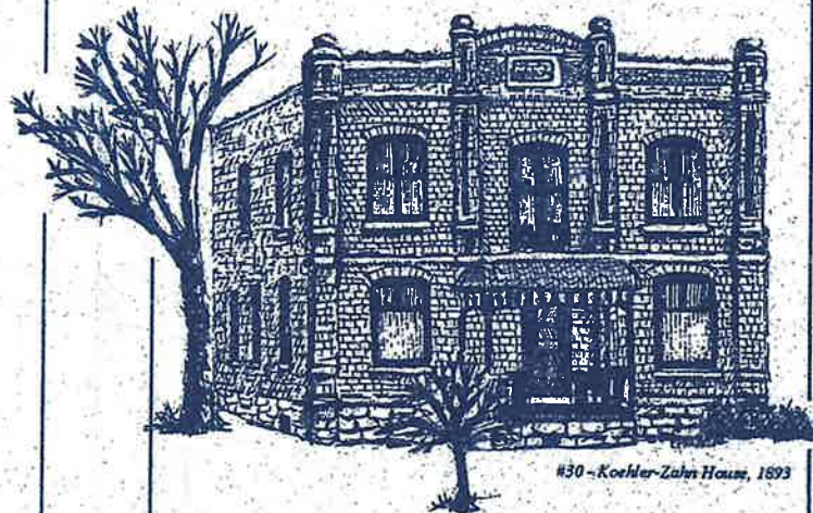
#30 - Koehler-Zahn House, 1893

Menomonee Falls Chamber of Commerce & Visitor Center N88 W16621 Appleton Avenue