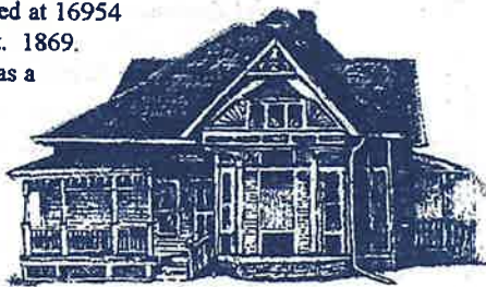
#11 - Albert Baer Residence, 1893