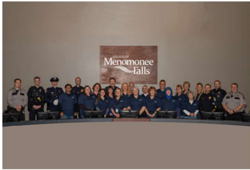
Citizen Police Academy – Session #14

Welcome to Menomonee Falls! “Wisconsin’s Largest Village” occupies a scenic 33 square mile setting with small town charm, yet a modern convenient lifestyle.