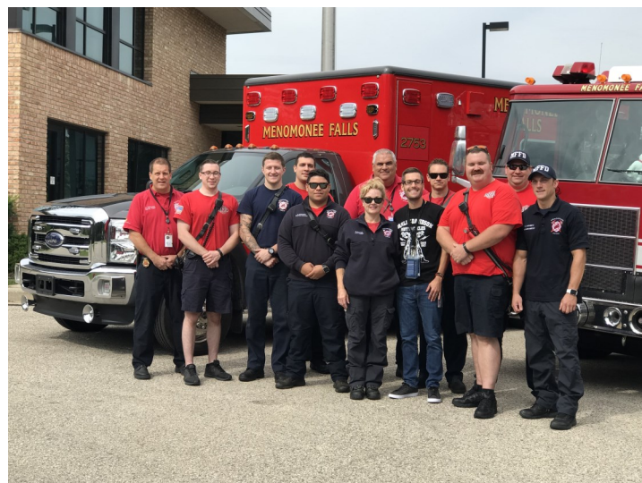
Throwback to 2018