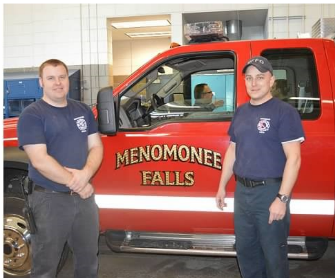
Throwback to 2013

FDIC 2023 Keynote FDIC International 2023: An Unquenchable Faith - Fire Training Conference