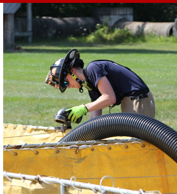
Tender operations training