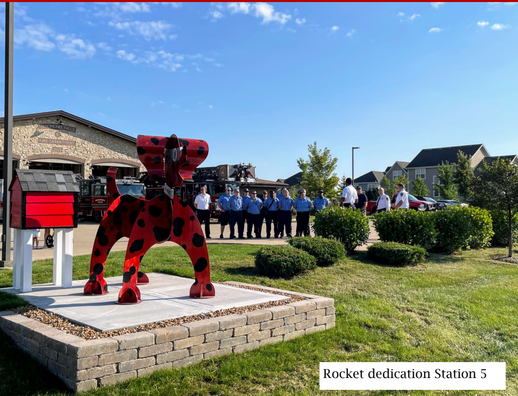
Rocket dedication Station 5