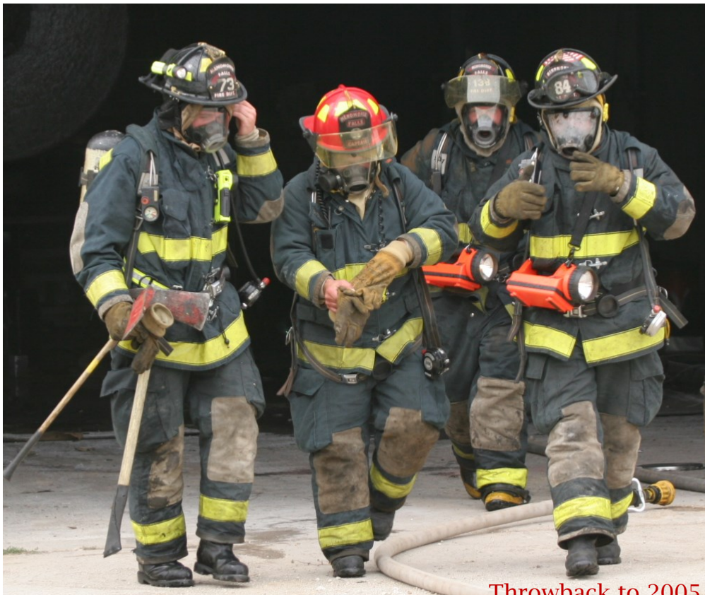
Throwback to 2005