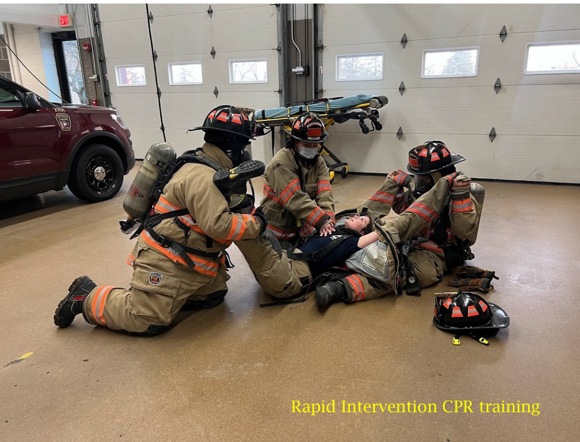
Rapid Intervention CPR training