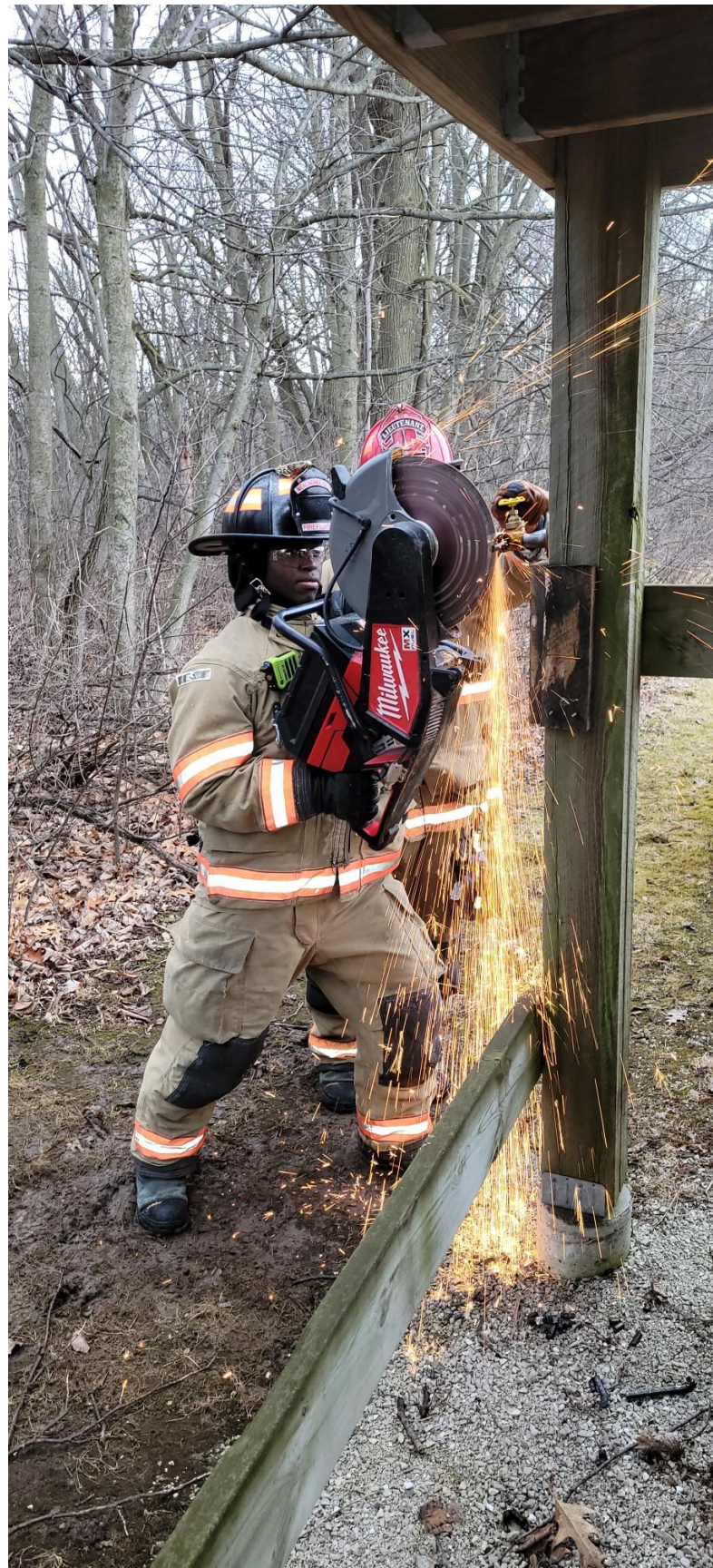
Rotary and chainsaw training