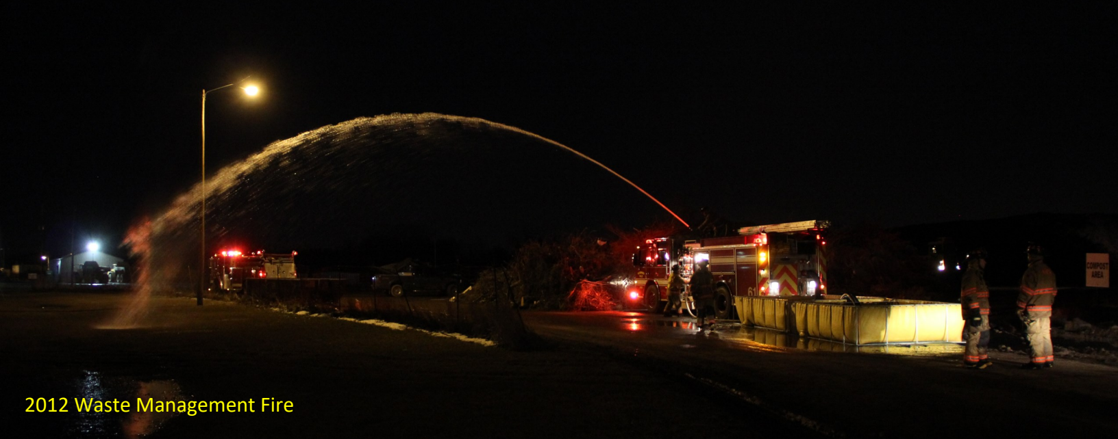
2012 Waste Management Fire