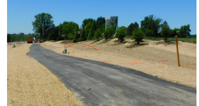
A new trail along Lisbon Road

Menomonee Falls now has over 32 miles of asphalt recreational trails. In addition to the Bugline Trail and Menomonee River Parkway Trail, asphalt trails have been built along major streets, through parks, and adjacent to residential subdivisions. To learn more about trails in the Village visit www.menomonee-falls.org/parks