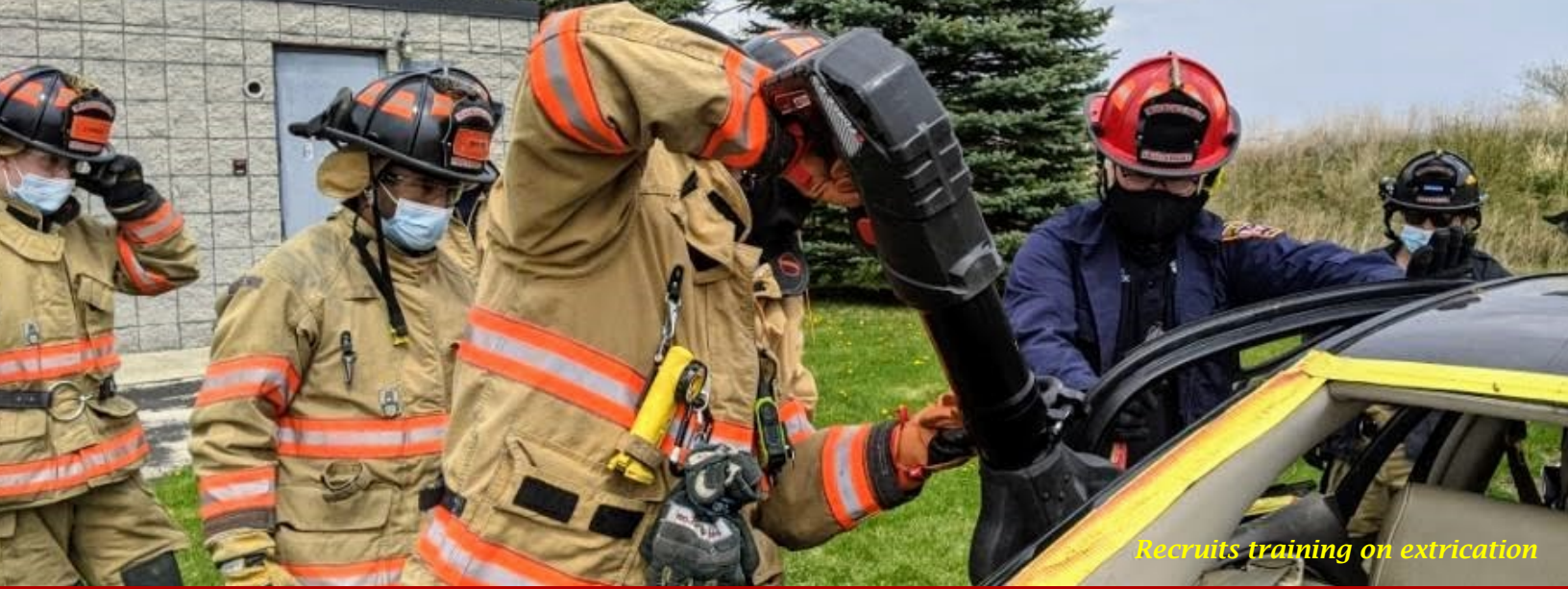
Recruits training on extrication