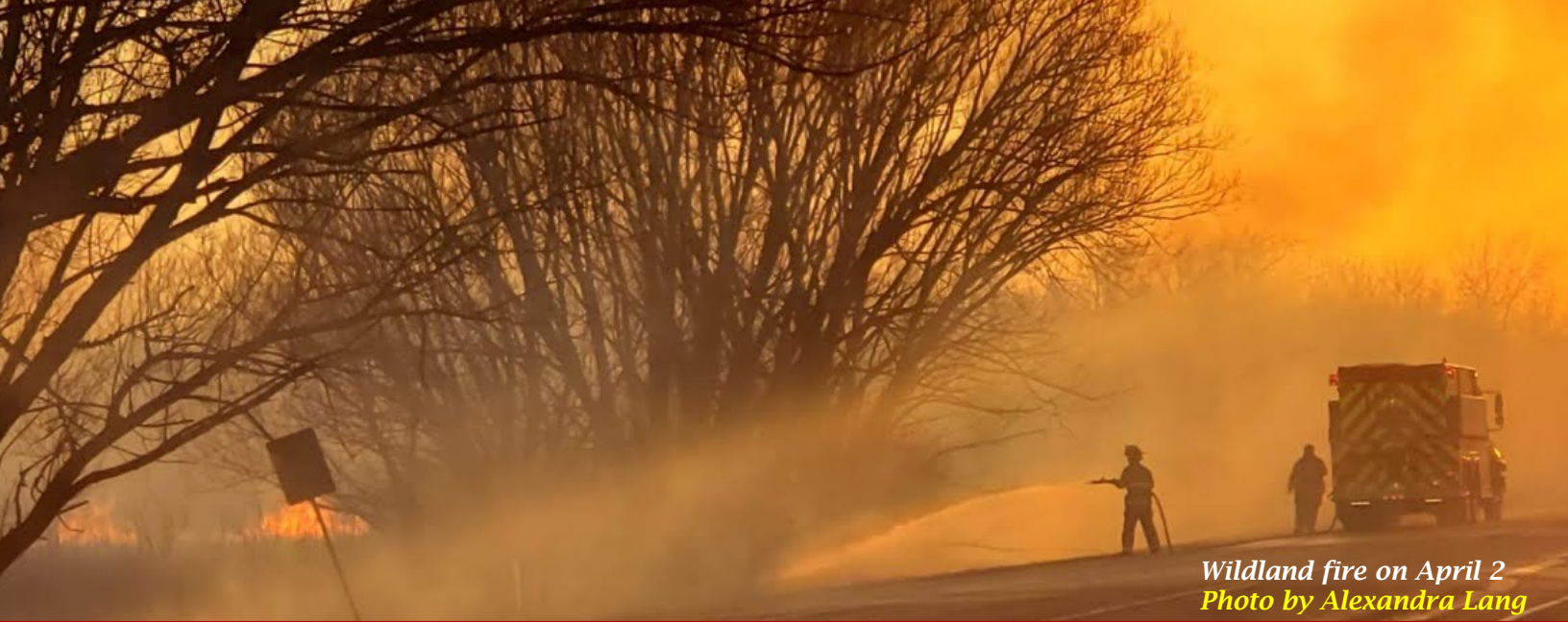
Wildland fire on April 2