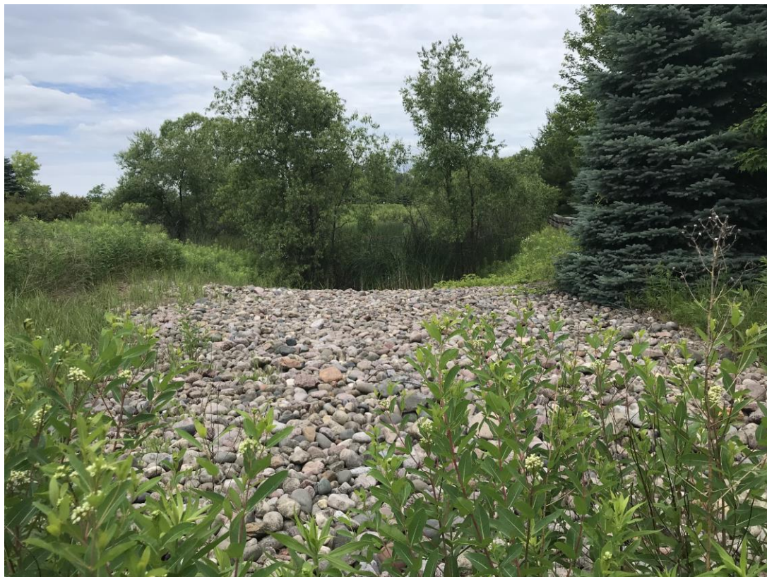
Figure 5: At south portion of pond; looking northerly, pond in background (emergency spillway)