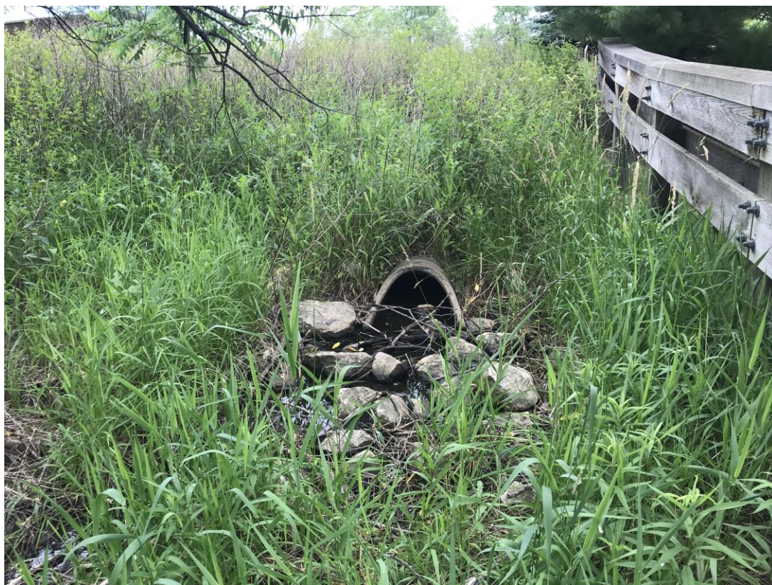
Figure 6: Approximately 80 feet south of pond; looking northerly (pond overflow outlet)