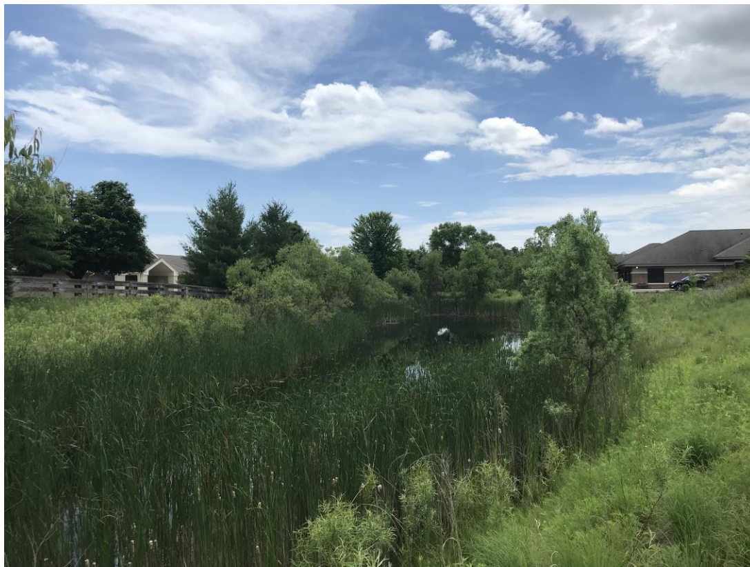
Figure 1: At north portion of pond; looking southerly (storm outfall and pond outlet)