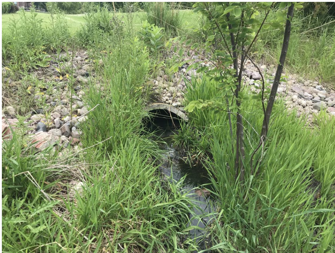
Figure 3: At south portion of pond; looking westerly (storm outfall)