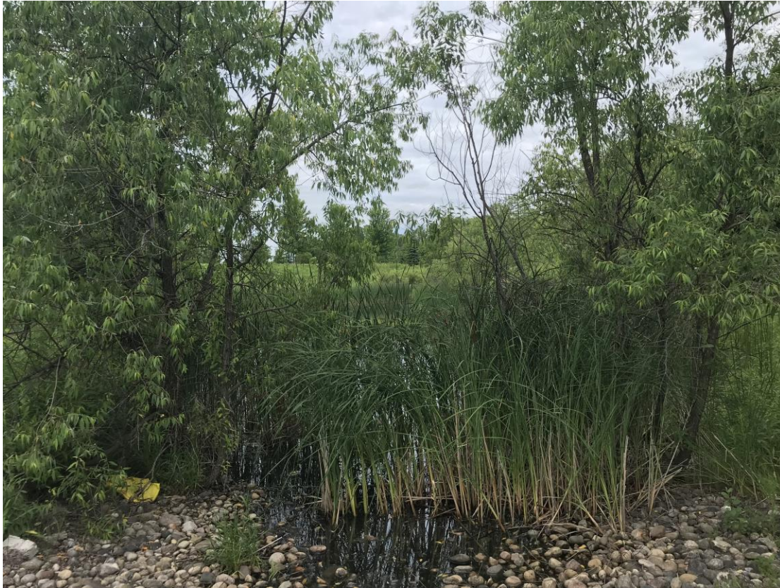
Figure 7: At south portion of pond; looking northerly (rip rap)