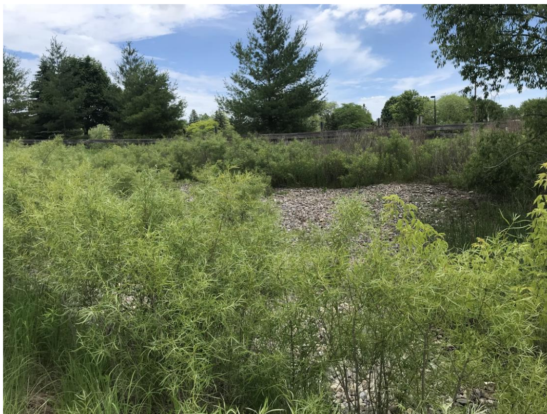
Figure 2: At north portion of pond; looking northerly (rip rap)