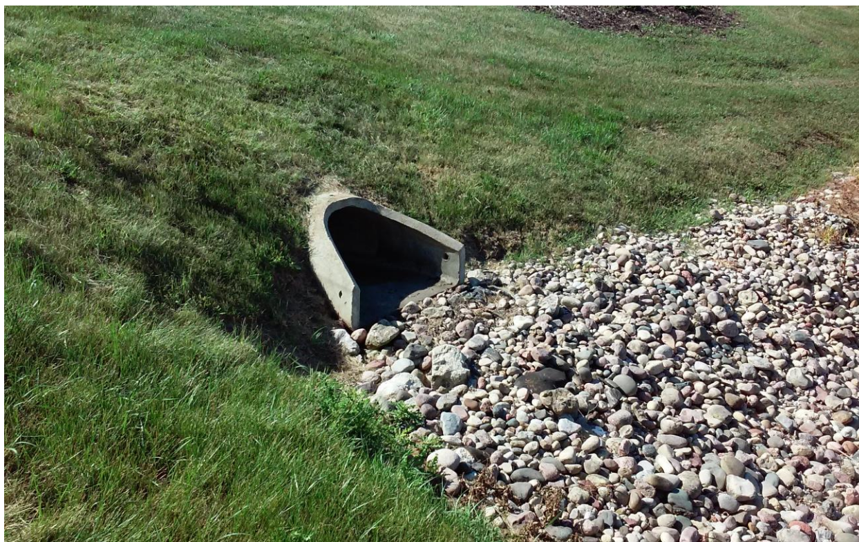
Figure 3 At northeast portion of pond; looking easterly (storm outfall)