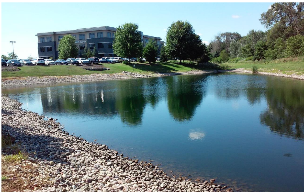
Figure 4: At northwest portion of pond; looking southeasterly (storm outfall)