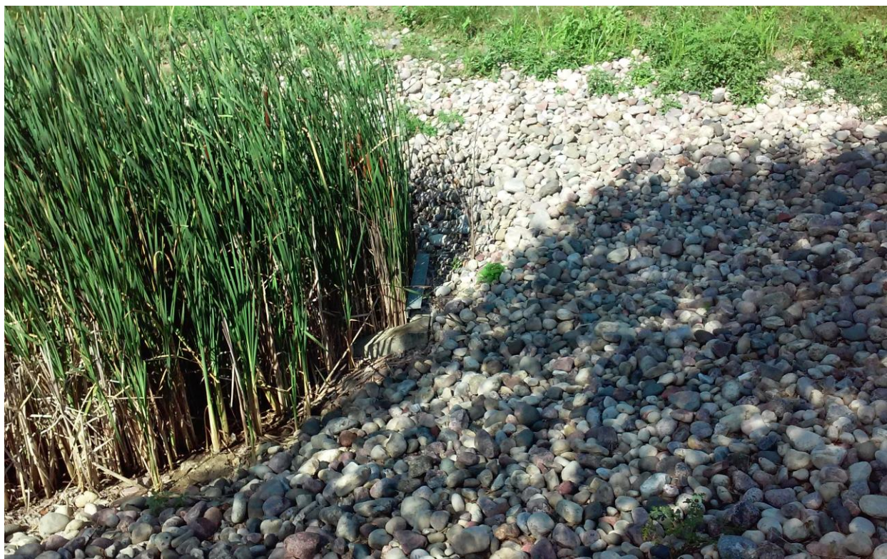
Figure 5: At northwest portion of pond; looking southwesterly (pond outlet structure)