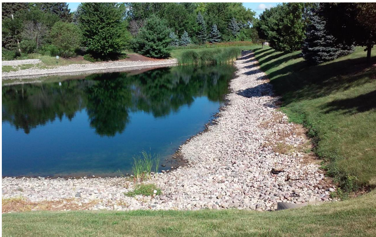
Figure 1: At northeast portion of pond; looking northwesterly (emergency spillway and pond outlet structure)