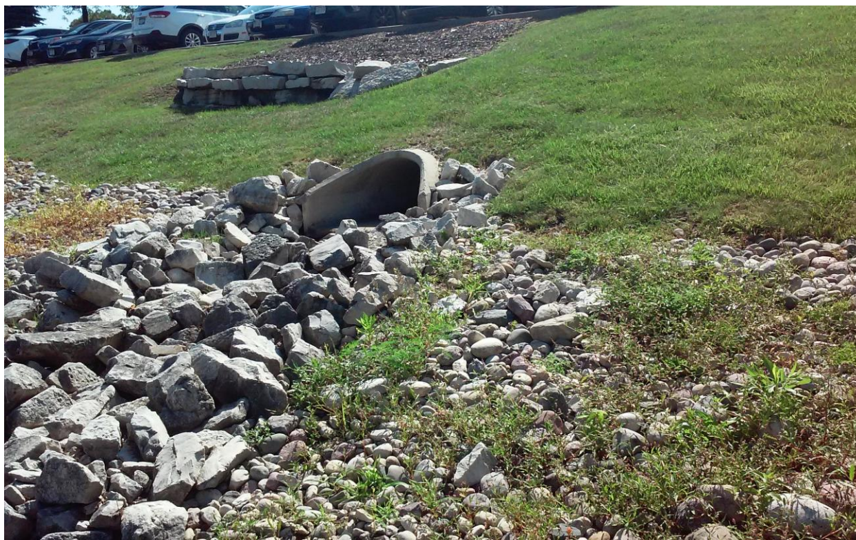
Figure 7: At east portion of pond; looking easterly (storm outfall)