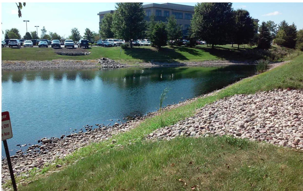
Figure 6: At northwest portion of pond; looking southeasterly (storm outfall and emergency spillway)