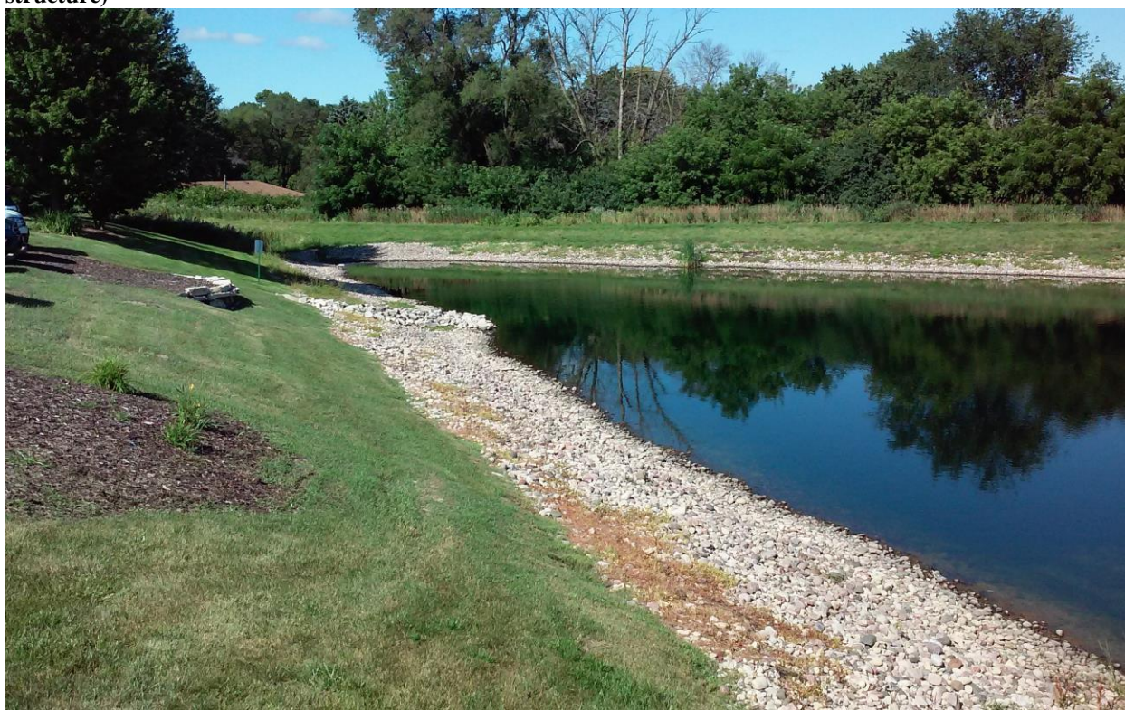
Figure 2: At northeast portion of pond; looking southeasterly (storm outfall)