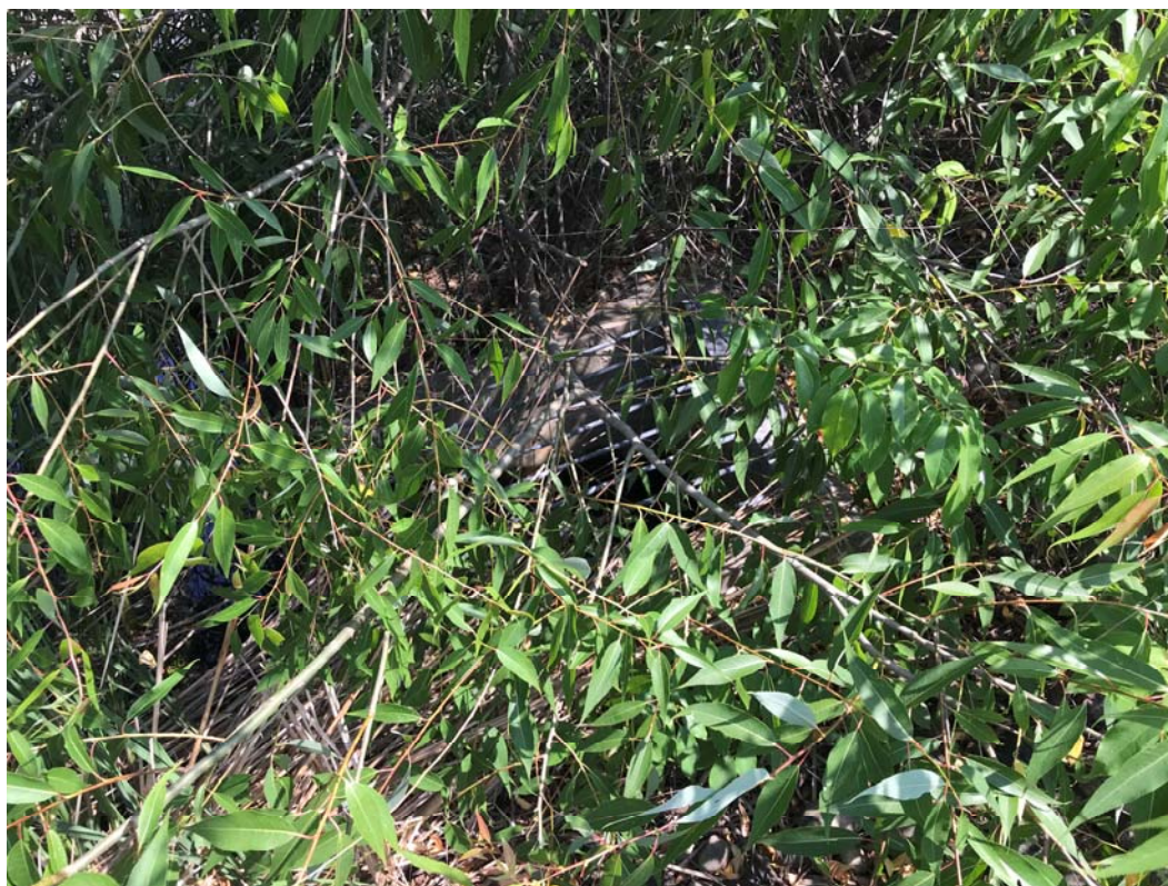
Figure 5: At east portion of pond; looking northerly (pond outlet structure)