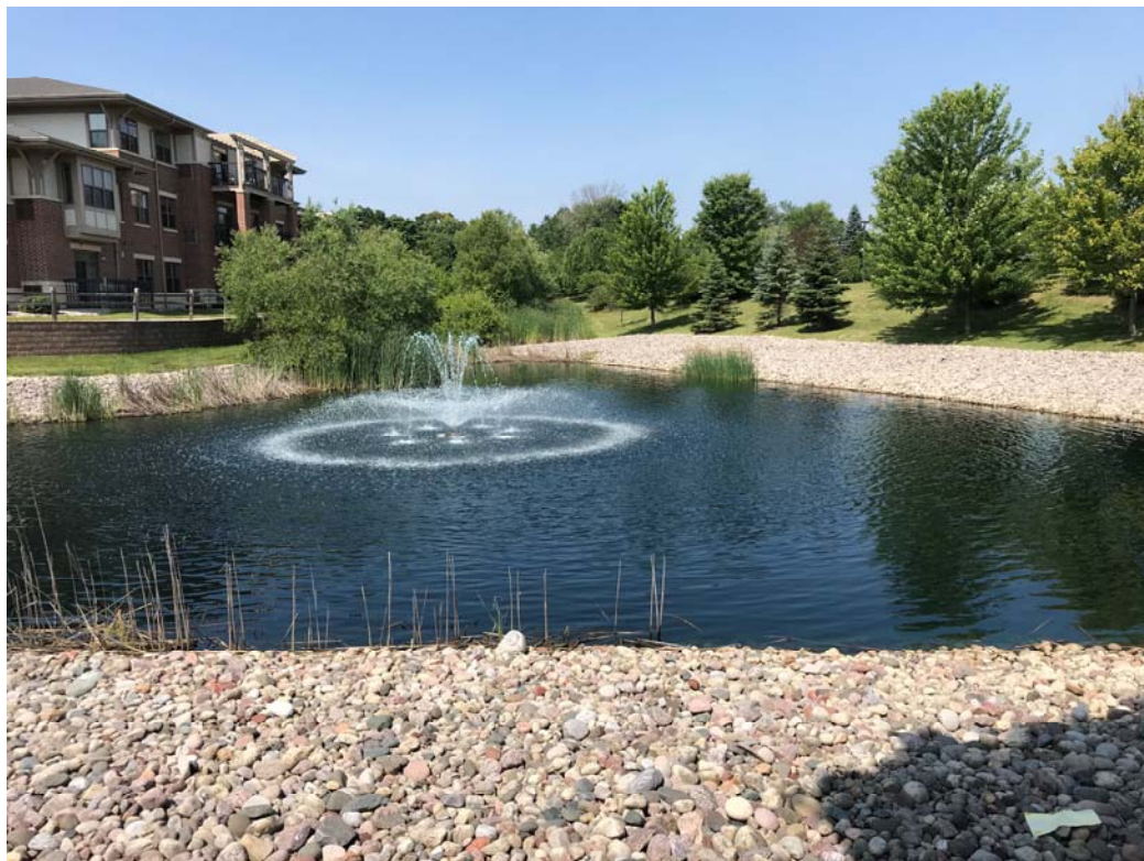
Figure 1: At east portion of pond; looking westerly (storm outfall)