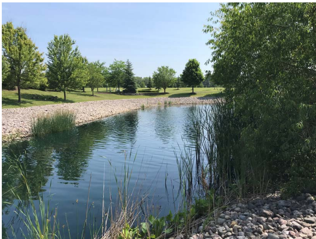
Figure 3: At southwest portion of pond; looking northeasterly