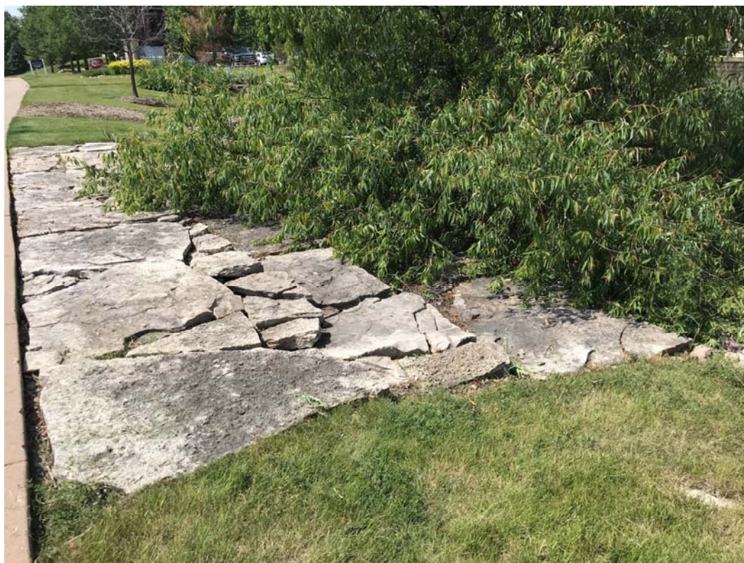
Figure 6: At east portion of pond; looking southerly (emergency spillway)