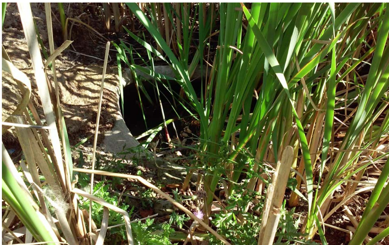
Figure 4: At west portion of pond; looking northerly (storm outlet)