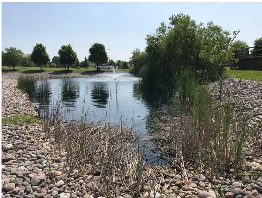
Figure 2: At west portion of pond; looking easterly (pond outlet structure)