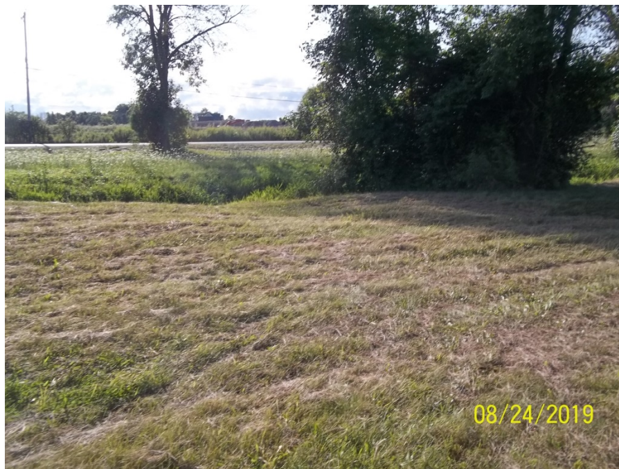
Looking SE toward Lilly Rd