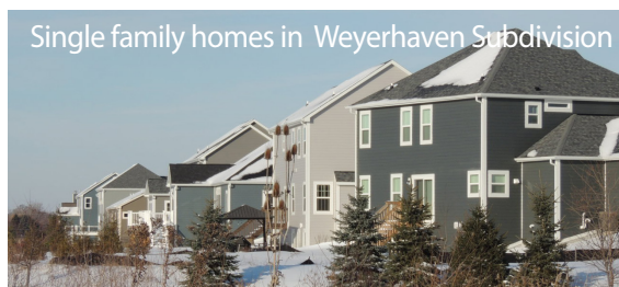
Single family homes in Weyerhaven Subdivision