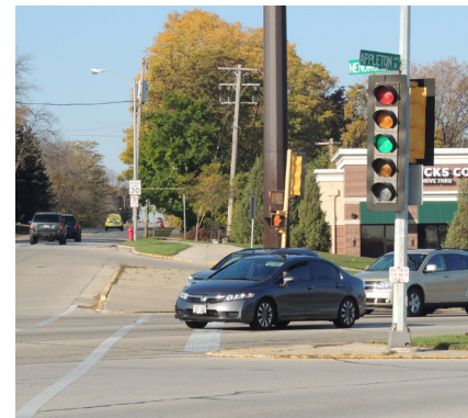
The planned project at the intersection of Appleton Avenue/Pilgrim Road/Menomonee Avenue will improve traffic flow and crossing safety in 2020

The main and sprinkling meters are read on a quarterly basis. During the billing process, the reading on the sprinkling meter is subtracted from the main meter; thus, avoiding a sewer charge. To install a sprinkling meter, the resident owning the home can do the plumbing themselves with the proper permits. More information about the meter size and rental charges, and an installation diagram can be found on the Village's website: menomonee-falls.org/watermeters .