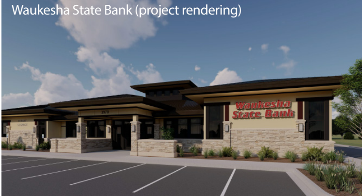
Waukesha State Bank (project rendering)