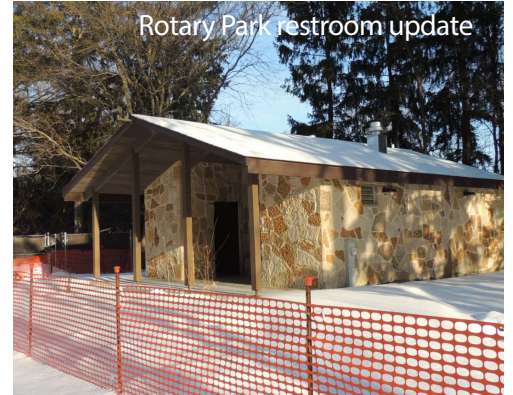
Rotary Park restroom update