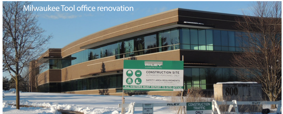
Milwaukee Tool office renovation

For a list of all of the Village's 2020 public projects see page 15