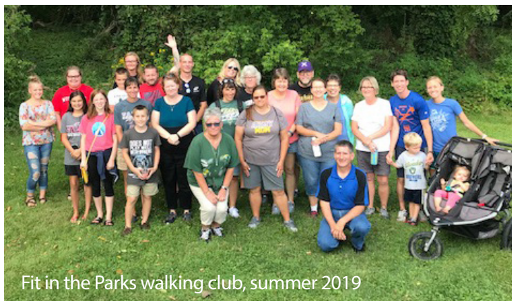
Fit in the Parks walking club, summer 2019