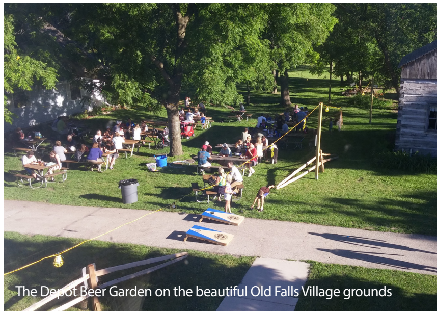
The Depot Beer Garden on the beautiful Old Falls Village grounds

The Depot Beer Garden will be open every Saturday evening from May 30 through October 3. The Depot Beer Garden offers a great family atmosphere, and pets are welcome. On site parking is ample and free. The Beer Garden will offer a variety of craft beers from several breweries and a selection of snacks, including grilled brats, hot dogs, and pizza. The Beer Garden is moving to the area in front of the stage to better enjoy the live music planned for every Saturday. New shade umbrellas and a permanent pavilion will enhance your enjoyment of the cold beer and great entertainment.