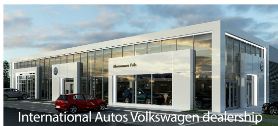
International Autos Volkswagen dealership