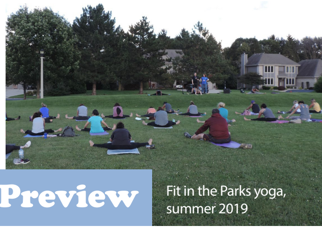
Fit in the Parks yoga, summer 2019

Community Education & Recreation (CE & Rec) staff are busy planning for a great summer of programs and activities for youth and adults of all ages. We have you covered with swim lessons, Summer Kids INC, Falls Summer Academy, adult athletics, youth sports, and Fit in the Parks just to name a few. We also offer a variety of trips for older adults, and our Senior Center operates year round!