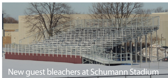
New guest bleachers at Schumann Stadium