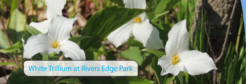
White Trillium at Rivers Edge Park