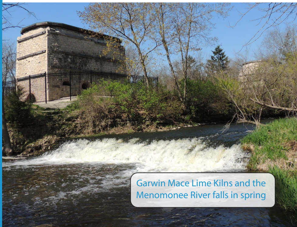
Garwin Mace Lime Kilns and the Menomonee River falls in spring