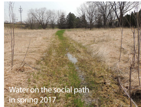
Water on the social path in spring 2017

Other projects being completed in 2019 include updates to science classrooms and the building exterior at North Middle School, new windows and office space at Shady Lane Elementary, and paint/flooring updates across the district.