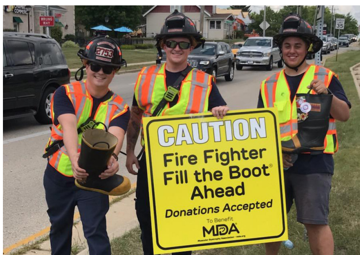
Firefighters collecting donations for the Muscular Dystrophy Association along Appleton Avenue