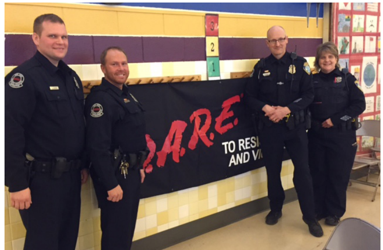
School Resource Officers have led thousands of the Village's fifth grade students through the Drug Abuse Resistance Education (DARE) program