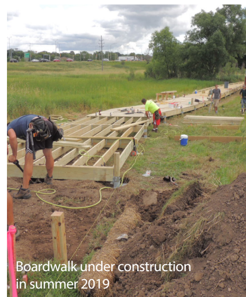
Boardwalk under construction in summer 2019