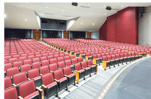
Auditorium improvements at MFHS will be similar to those completed at North Middle School (shown above)